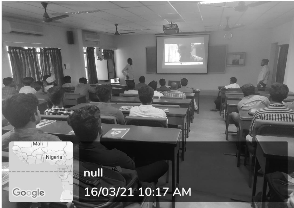
Student Participation in Two Days Workshop on Research Methodology for Social Science – 16 th & 17 th March, 2021