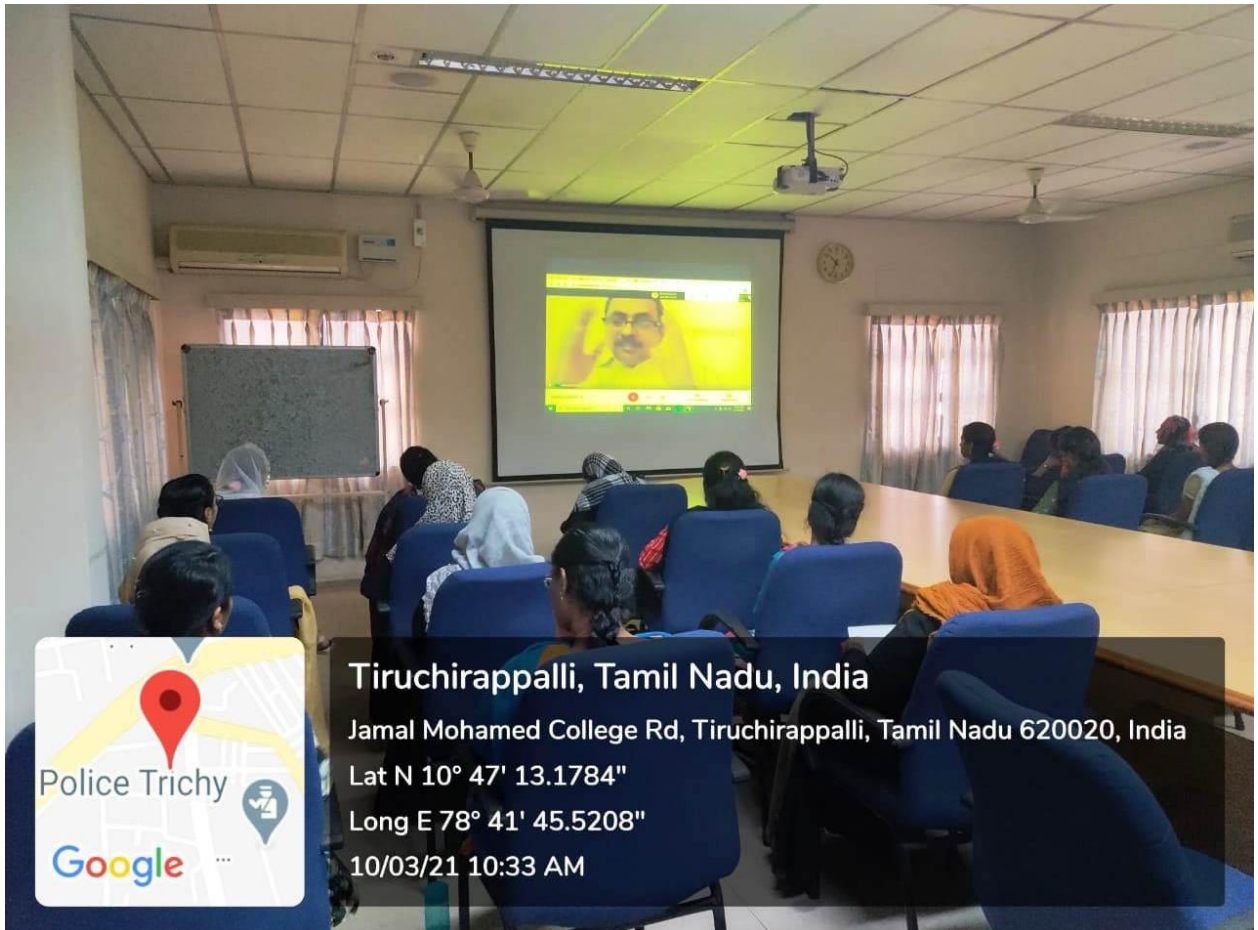
Participation of Women student group in National Webinar on Career Development through Virtual Mode.