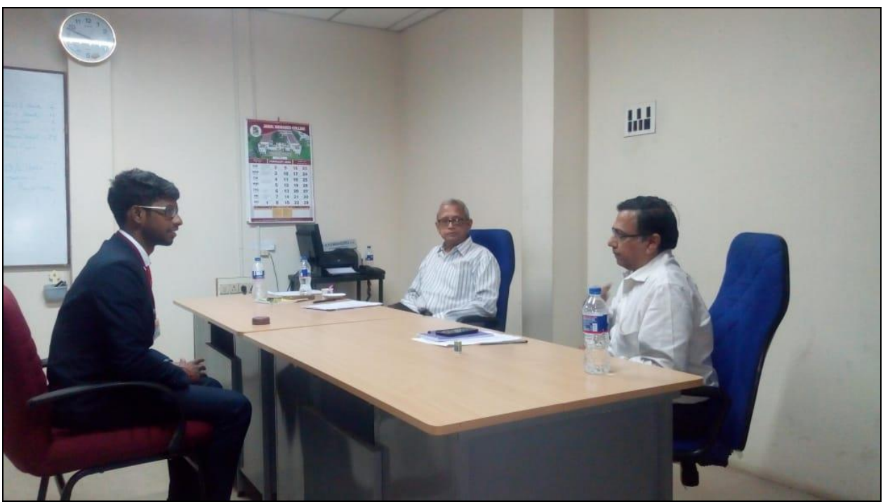
Conducting of personal interview by City Union Bank , HR team at Placement Cell, Jeddah Block.

Conducting of personal interview by City Union Bank HR team at MBA Conference hall, Jeddah Block.