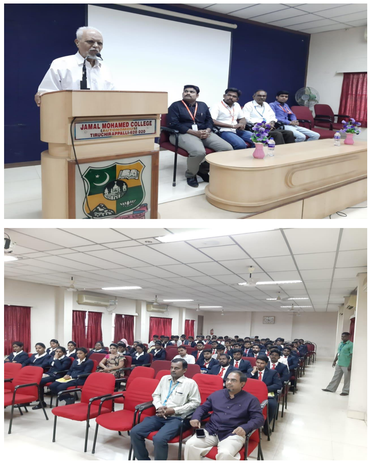
Participation of students in the briefing section by More Retail Limited.

Welcome address by Placement Head of Jamal Institute of Management on Campus Placement Drive by More Retail Limited on 20th December, 2019.