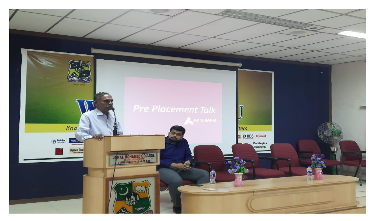
Welcome address by Director Jamal Institute of Management on Campus Placement Drive by AXIS Bank on 17th December, 2019.