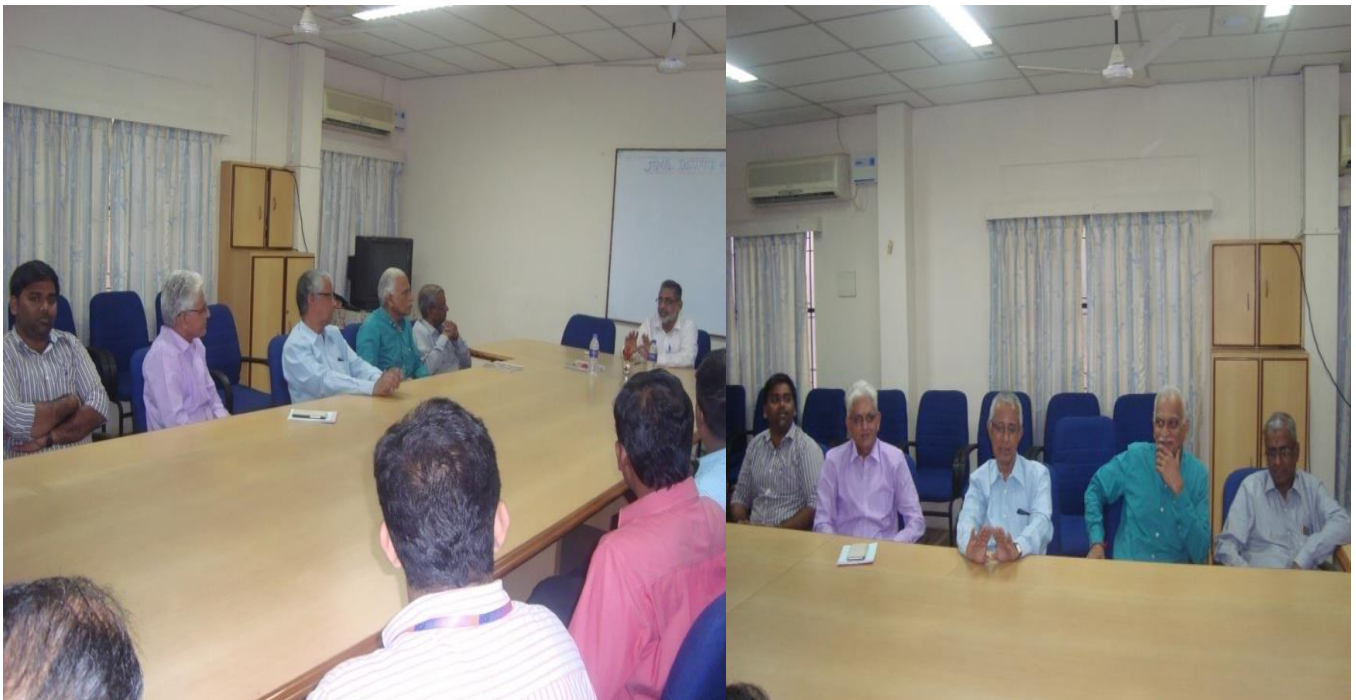
On 5.1.2018 City Union Bank officials meeting with the director and staff members after campus interview and give their feedback.

Just Dial, City Union Bank Ltd, NICE, ICICI, IDBI and more.