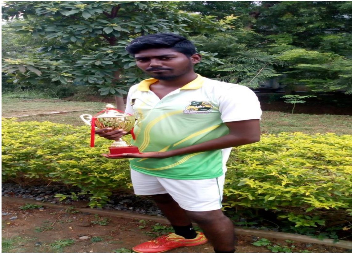
WINNERS IN BHARATHIDASAN UNIVERSITY INTER COLLEGE BALL BADMINTON TOURNAMENT 2017