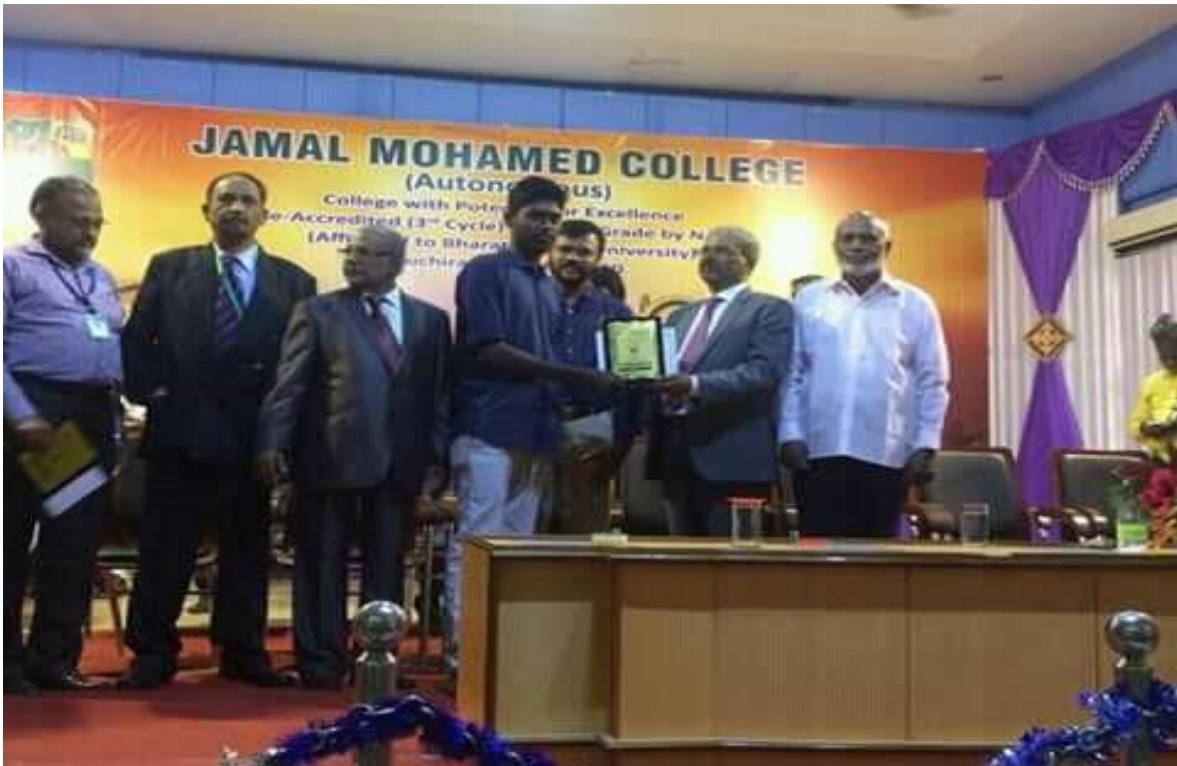
OUTSTANDING SPORTS PERSON AWARD in JAMAL MOHAMED COLLEGE 2016 - 2017.