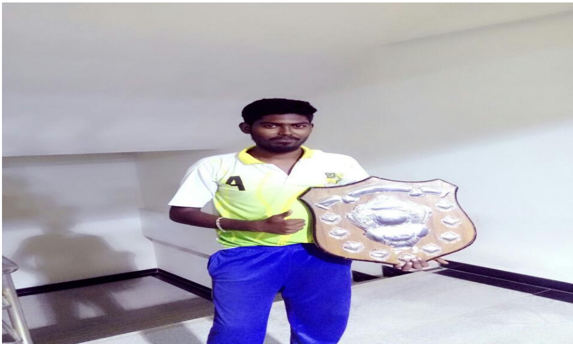
WINNERS IN PSG COLLEGE OF ARTS AND SCIENCE COIMBATORE STATE LEVEL TOURNAMENT