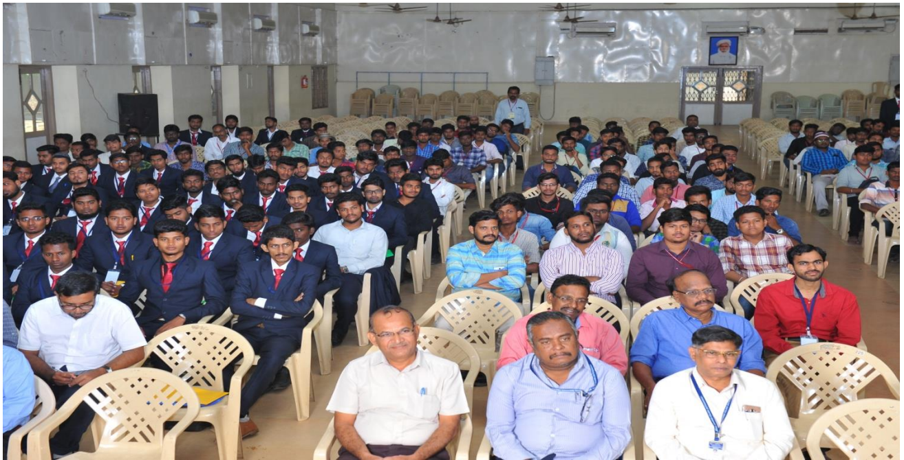
Participants and Department students at ICAM 2K18