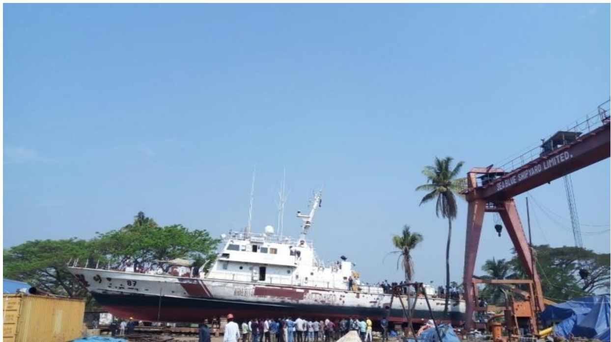
Having three slip ways ideal for hauling up and launching of medium type vessels and with wharf age for afloat repairs of vessels up to 120 meters long and 6.0 meters draft.