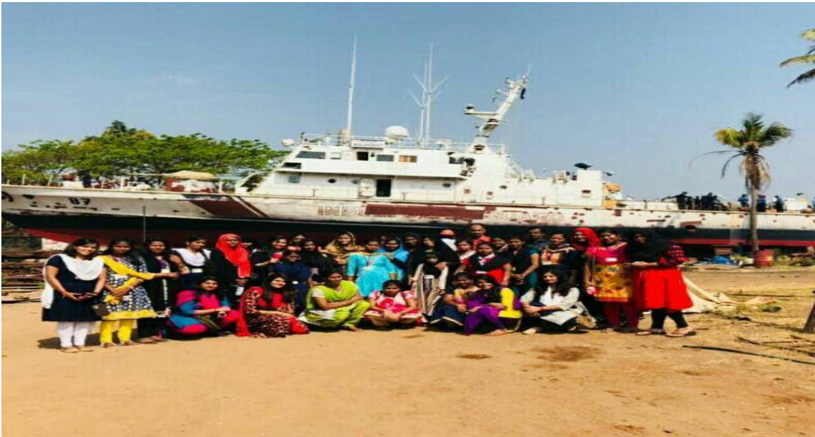
Company: Sea Blue Shipyard Ltd, Kochi, Kerala Established in 2003 ,ISO 9001-2008 certified