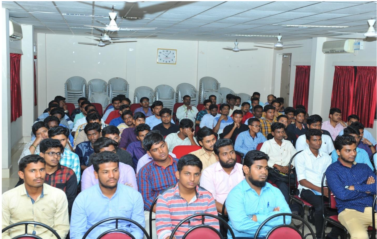
Students' participation in Special lecture Programme on “BECOMING PROFESSIONAL” at Jeddah Alumni Block, Seminar Hall.