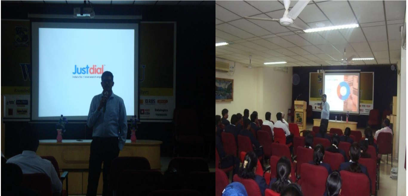
On 13 December 2017 Just Dial – Recruitment process for selecting the marketing Executives in campus interview