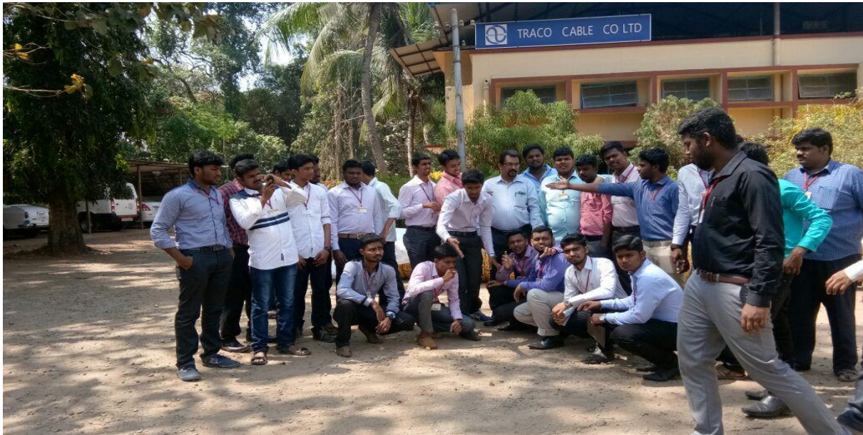
Traco Cable Company Limited a pioneer in Cable manufacturing since 1964

Jamal Institute of Management, Jamal Mohamed College (Autonomous), Tiruchirappalli organised Industrial Visit for MBA Men Students Place: Kannur & Munnar, Kerala