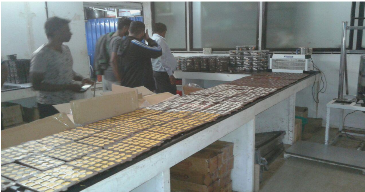
Students visit to Chocolate manufacturing unit at munnar