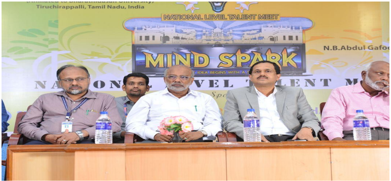
Management committee, Principal and Chief Guest during Valedictory function of MIND SPARK.