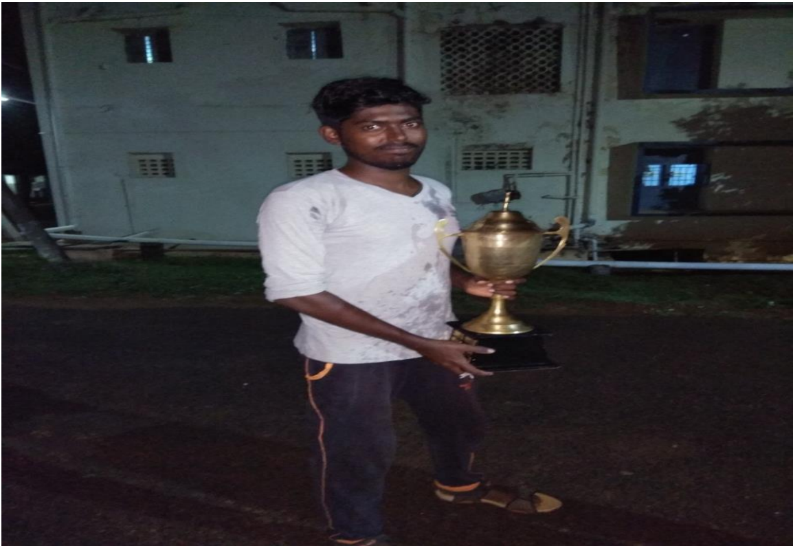
RUNNER IN LOYOLA COLLEGE STATE LEVEL BALL BADMINTON TOURNAMENT 2017-2018