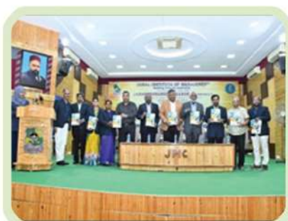
Silver Jubilee Souvenir Release