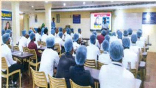
V.V.V & Sons Edible Oil Ltd, Virudhunagar.