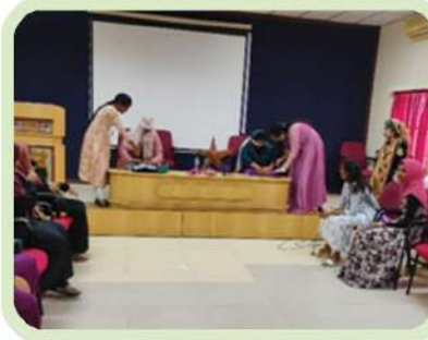
Christmas Celebration - 2024