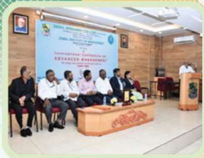
5 th International Conference on Advanced Management (ICAM 2025) on 'Driving Innovation in Global Context.'