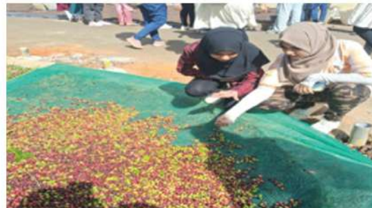
Avt Pasuparai Tea Factory, Kerala.