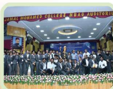
Tiecoons 2025 National Level Management Meet