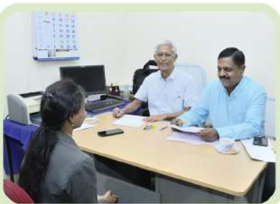
Interview Process by Senior Experts from CUB during Campus Placements