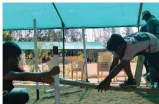
Outbound Experiential Learning for our MBA Students