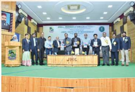
5 th International Conference on Advanced Management (Driving Innovation in Global Context) (ICAM 2025).