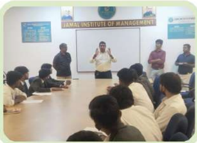
Interview Process by HR Team from D-MART during Campus Placements