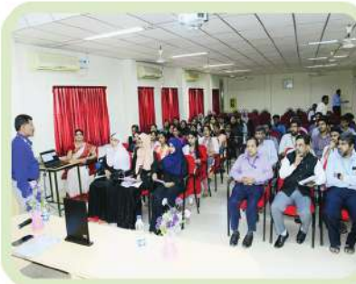
Three Days Workshop on "Streamlining Literature Review and E-Resource Access"