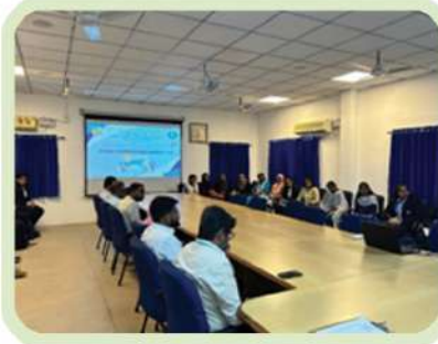
Poster Making Competition on occasion of Silver Jubilee Celebration