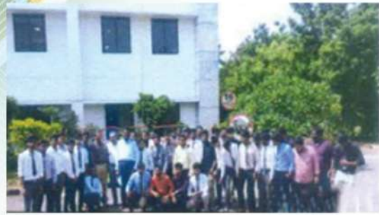
Maya Appliances Pvt Ltd, Chennai.

To bring immersive learning among students, every semester we incorporate industry visit as part of the curriculum. The aim of the industry visit every semester is to make the students to get exposure towards corporate world. The core objective of an industry visit is to provide students with real time practical experience on different functional areas of management.