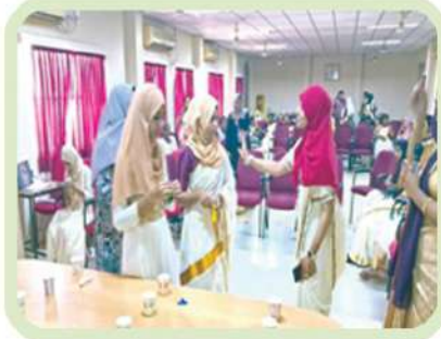
Onam Celebration - 2025