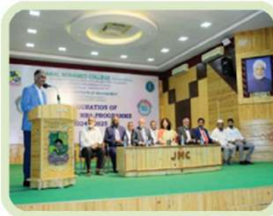
Inauguration of Silver Jubilee Batch