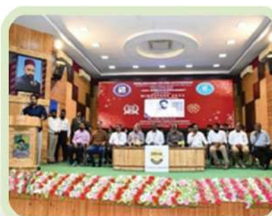
Mindspark 2025 State Level Management Meet