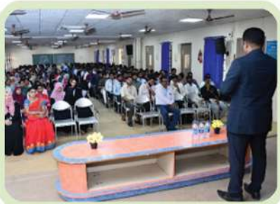
Domain Training by Experts from HCL Tech , Madurai