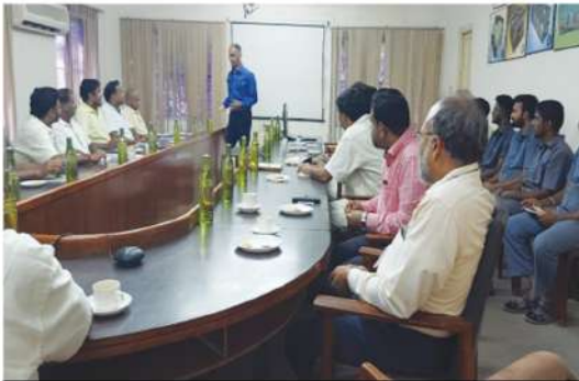
Executive Development Programme High Energy Batteries, Mathur.

In order to equip working executives with the necessary skills to adapt to shifting organizational demands and perform efficiently, we offer Executive Development Programmes. The Participants can discover their true potential and obstacles in the industry through the programme, which equips them with the knowledge, abilities and interests needed to soar to new professional heights.