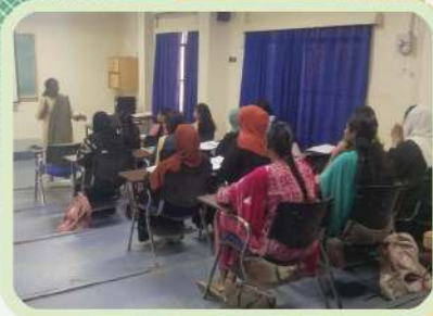
Training Session for our MBA Students by Expert Trainers from Naandhi Foundations , Chennai.