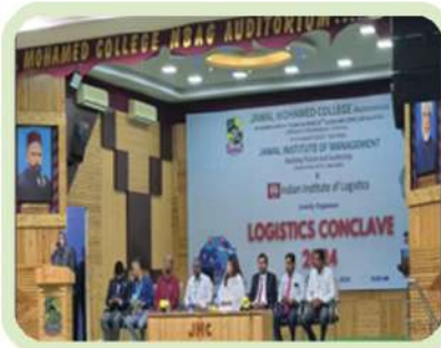
Logistics Conclave 2024 Empowering the future of logistics