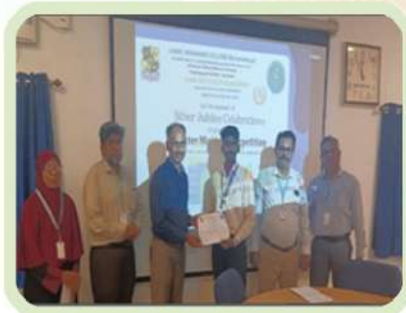
Paper Presentation Competition on occasion of Silver Jubilee Celebration