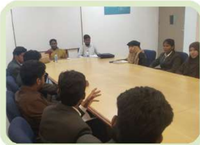
Interview Process by HR Team from Solamalai Entreprises during Campus Placements