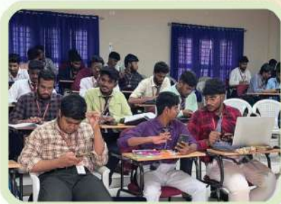
AI @ Work Certification Program by HCLTech Career Shaper