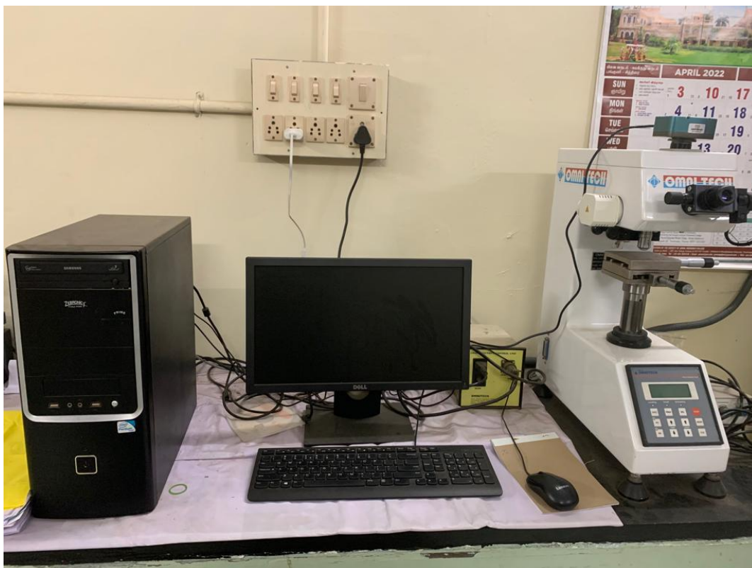
Vicker's Micro-hardness Tester