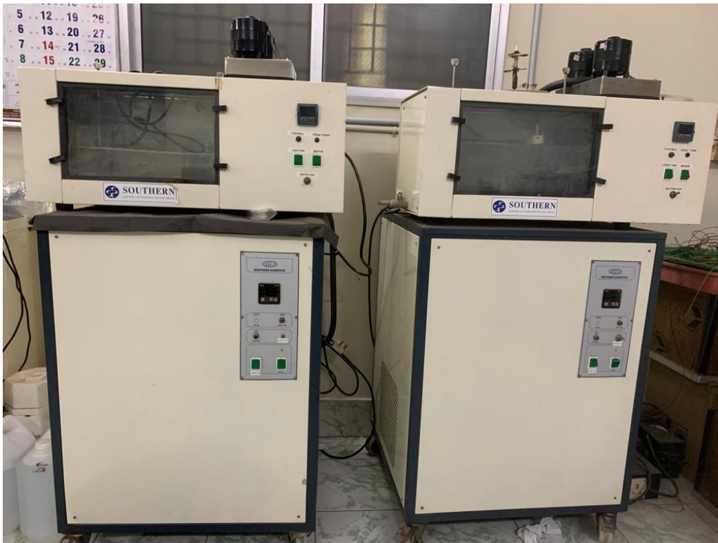
Constant Temperature Baths with Cooling Facility

This lab is being utilized for Growth of Non-linear optical crystals for laser application and synthesis of Nanomaterials for biomedical application.