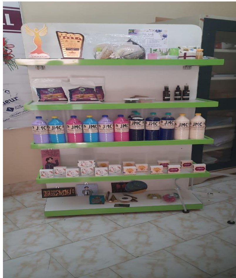
Products of student entrepreneurs displayed in front of EDC Outlet Entrance