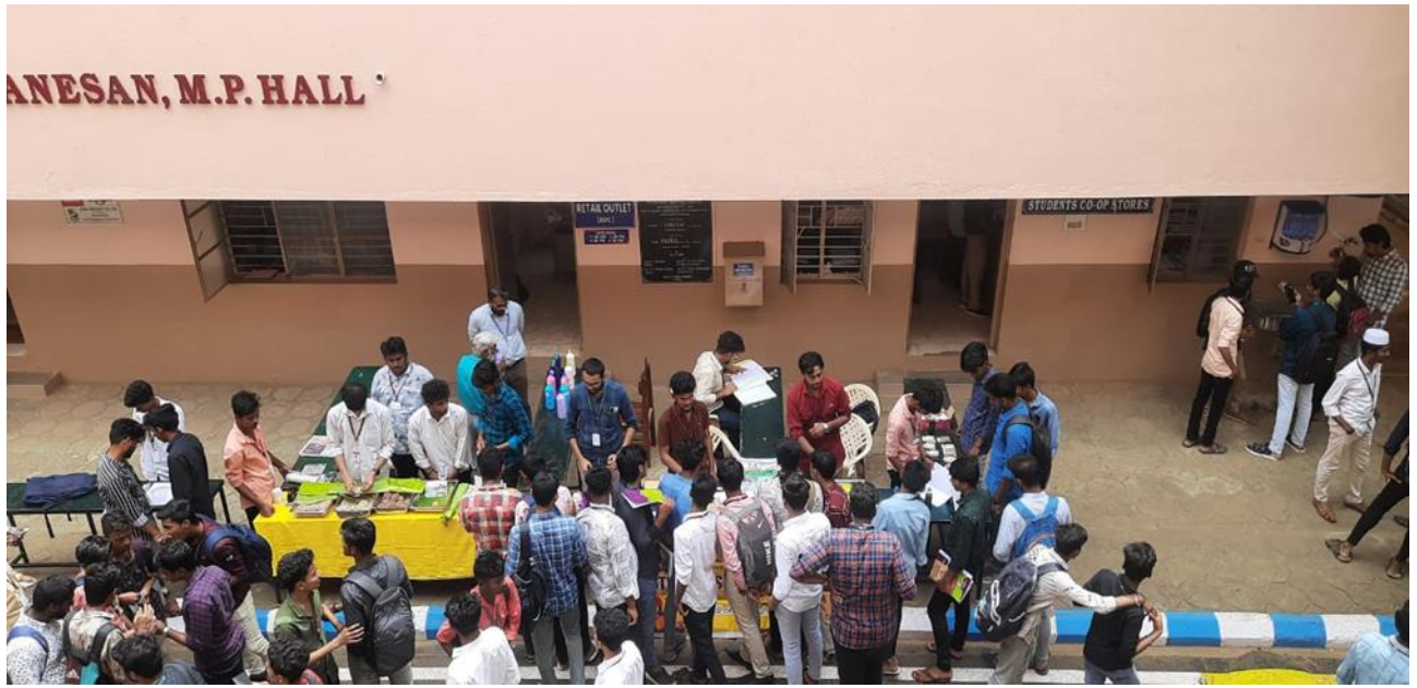
Students of our ED Cell marketing their own made products in the EXPO

5. Entrepreneurship Development Cell (EDC) of Jamal Mohamed College (Autonomous), Trichy organized a Entrepreneurs Expo on 14 th September, 2023.