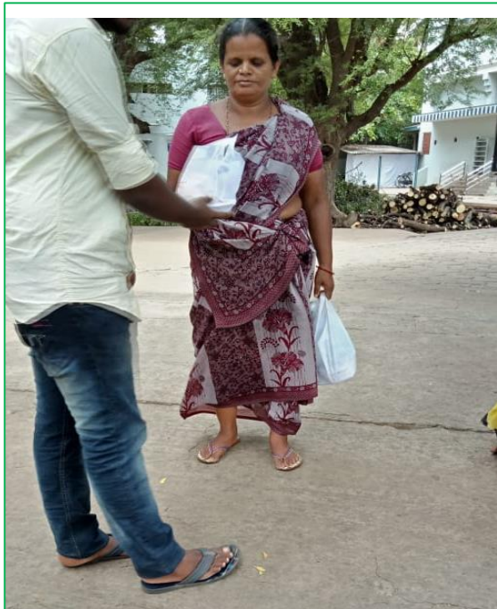
THE JOY OF GIVING WEEK” - distributed blankets to the needy on 18.12.2018