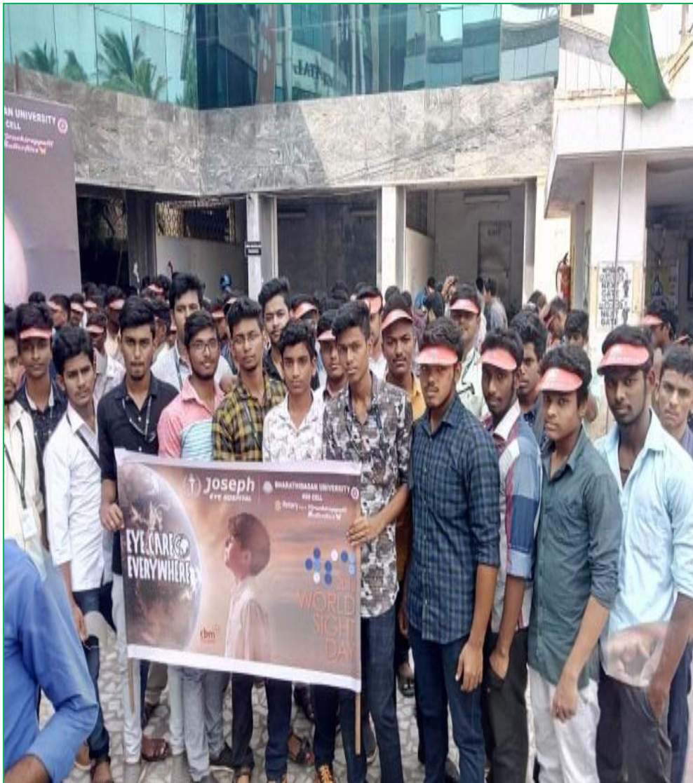
Eye Awareness Human Chain on 11.10.2018