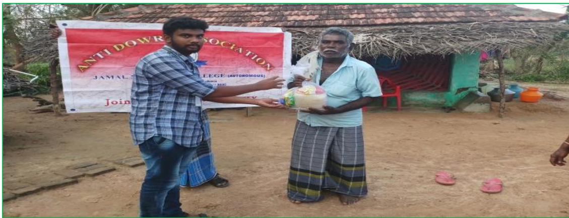
During Gaja Cyclone in the affected areas, Relief aid and assistance rendered in association with city corporation on 10.11.2018 & 10.12.2018