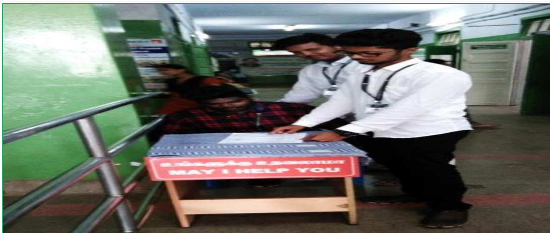
Volunteers Service at “ MAY I HELP YOU” desk at GOVERNMENT HOSPITAL TIRUCHIRAPPALLI on 12.11.2018 -26.11.2018 (2 weeks)