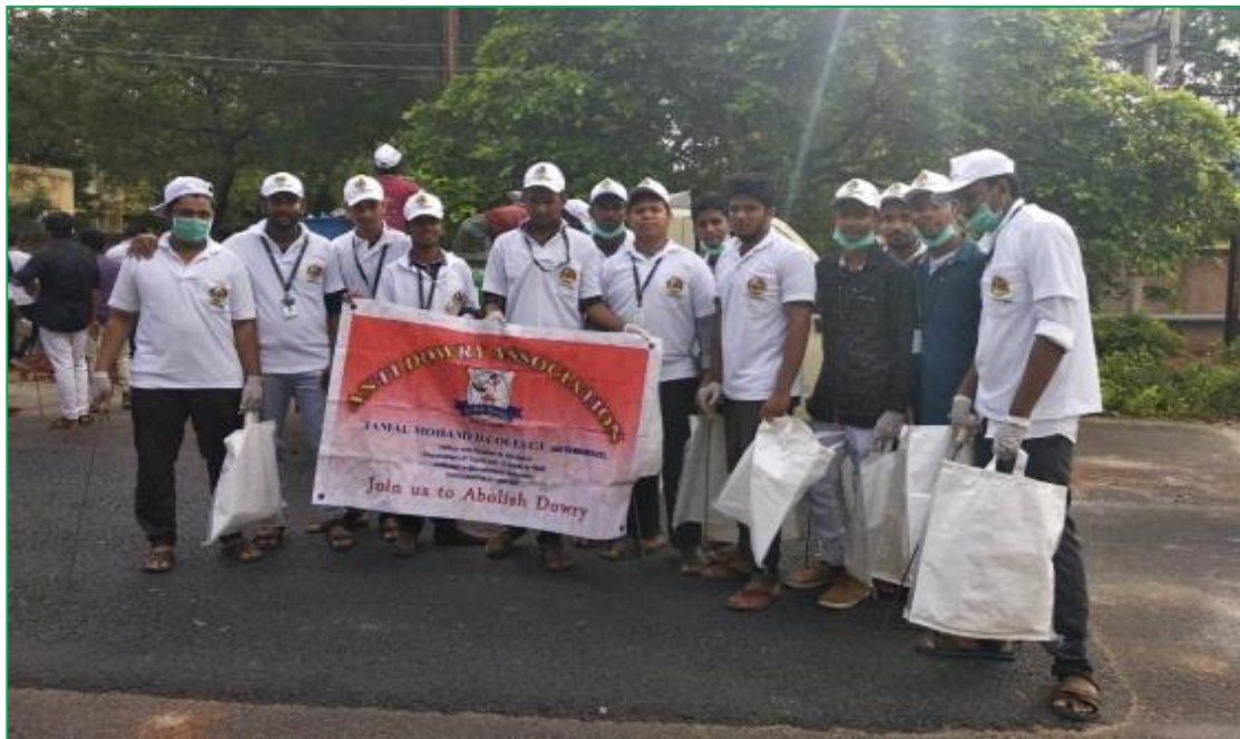
Swaach Bharath on Anna Studium 06.10.2018