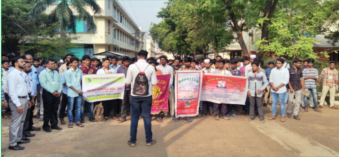
Took and Pledge against Corruption on 01.12.2018 (Vigilance Awareness)