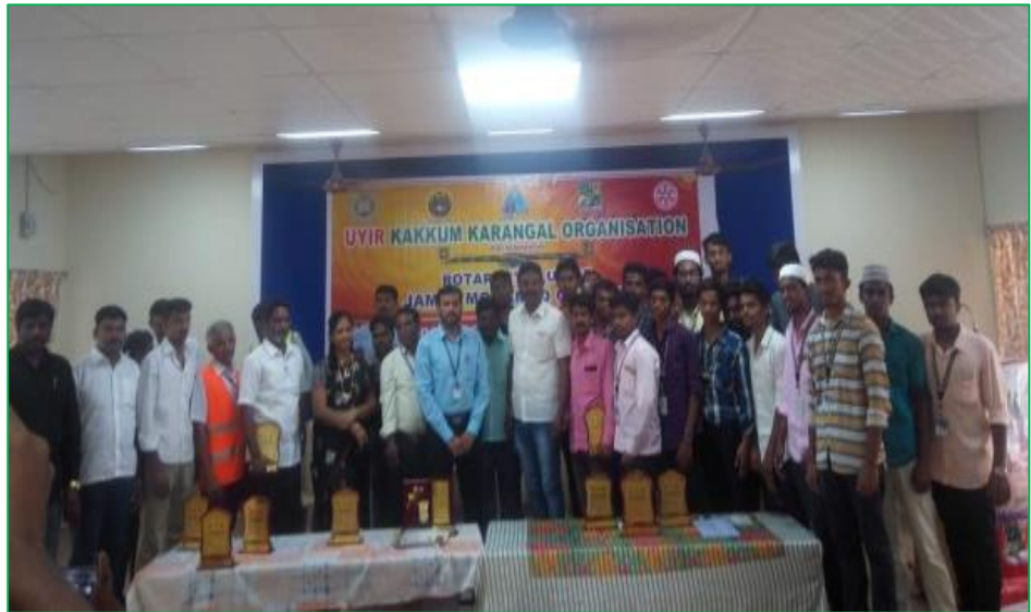
Road and Safety awareness programme on 09.01.2019