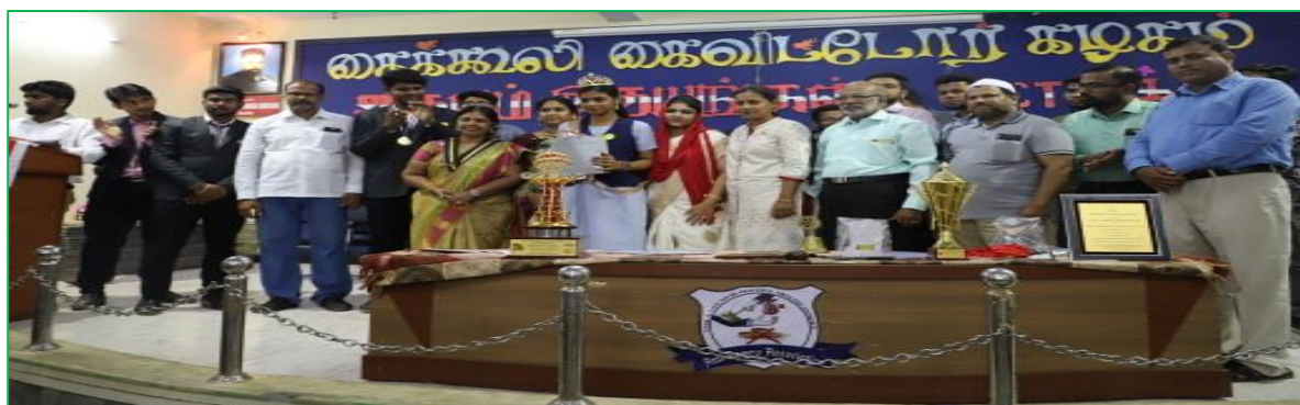
Madath Ezhuchi - Helping Fest for Specially abled Children on 16.02.2019