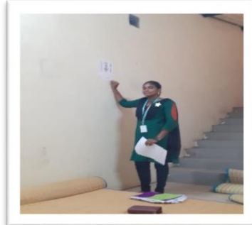
4. 09/09/2019 - Faith towards God is an important factor in one's life. We provided 10 prayer mats to the prayer halls in our college.