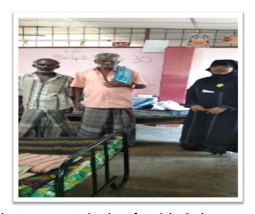
9. 8/03/2020 - Our club volunteers supported and comforted the Orphanage people by having "LIFE CONVERSATION" with them.