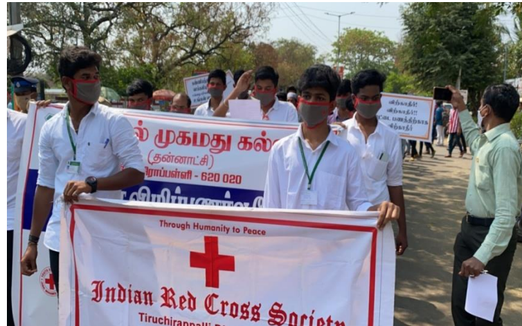
The Voter's Awareness Rally was started from Jamal Mohamed college campus and went upto the Head Post Office, then return to the college campus.