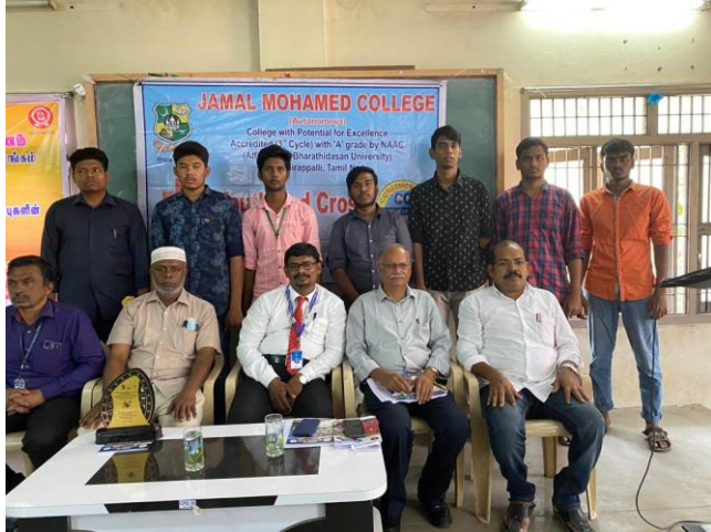
Delegates Honouring the Chief Guest with a memento