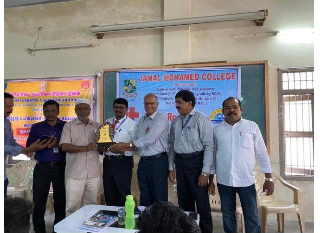
Citizen Consumer Club Office Bearers with