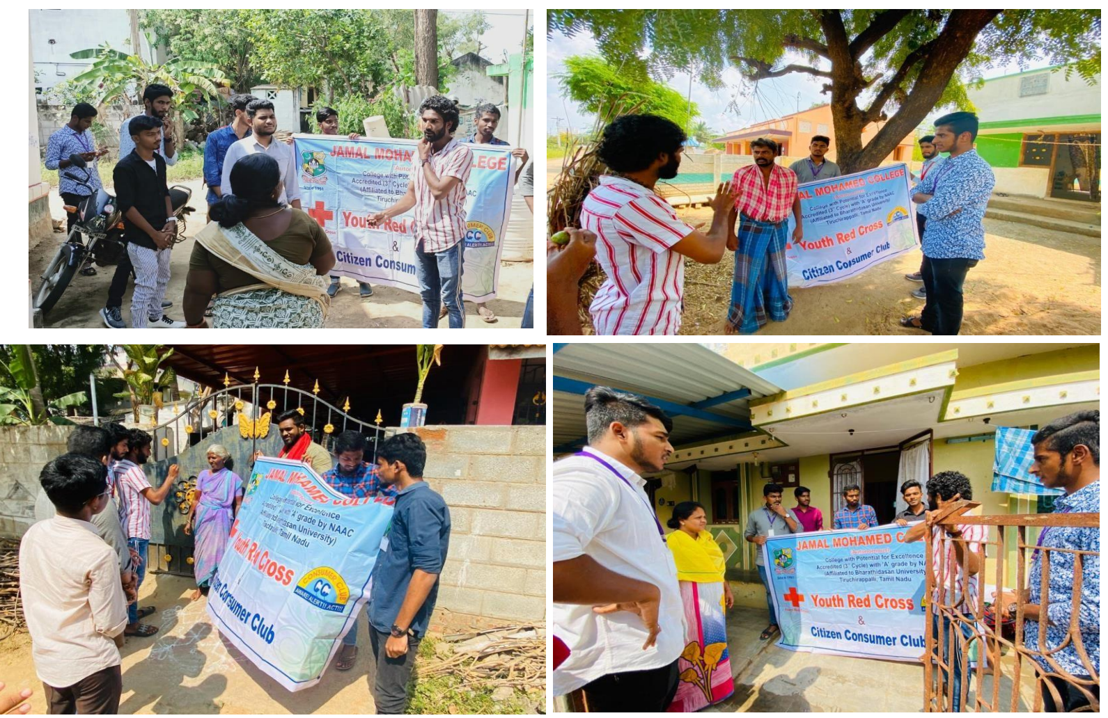
AWARENESS ON LPG'S MADE BY CCC STUDENTS ON VARIOUS HOUSES

awareness and precautionary measures. They were also made in the know about the actual and precise cost of cylinder and requisite to avoid payment of extra money to the delivery agent of LPG. They were made aware of the basic consumer rights in regard to the LPG cylinders.