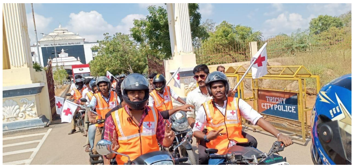
STUDENTS OF JAMAL MOHAMED COLLEGE FROM THEIR RESPECTIVE CLUBS TAKING PART IN THE RALLEY.

The INDIAN RED CROSS SOCIETY organised a state level motor Cycle relay ralley on Mark or Indian red Cross centenary celebration(1920-2020). The Relay ralley started from kanyakumari To Chennai celebrating the services done by Red cross. District collector, who is also the president of Indian Red Cross Society (IRCS) Tiruchirappali branch, flagged off the IRCS centenary vehicle rally at the collectorate. Over 50 bikes, including members from Junior Red Cross, took part in the rally which lasted about an hour through various places and institution.