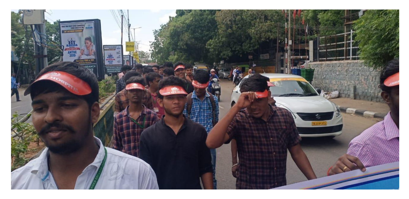
STUDENTS OF OUR COLLEGE TAKING PART IN THE RALLEY

The youth red cross and citizen consumer club of jamal Mohamed college participated in the rally organized by the Joseph eye hospital,Trichirappali.This event was inaugurated by the vice chancellor of Bharathidasan university.A number of students from various colleges participated in this rally.36 students belonging to the club of our colleges marched around 3 kilometers and paved way for grant success of this event.This rally was held to make people realize about the importance of vision and necessity of the eye donation.