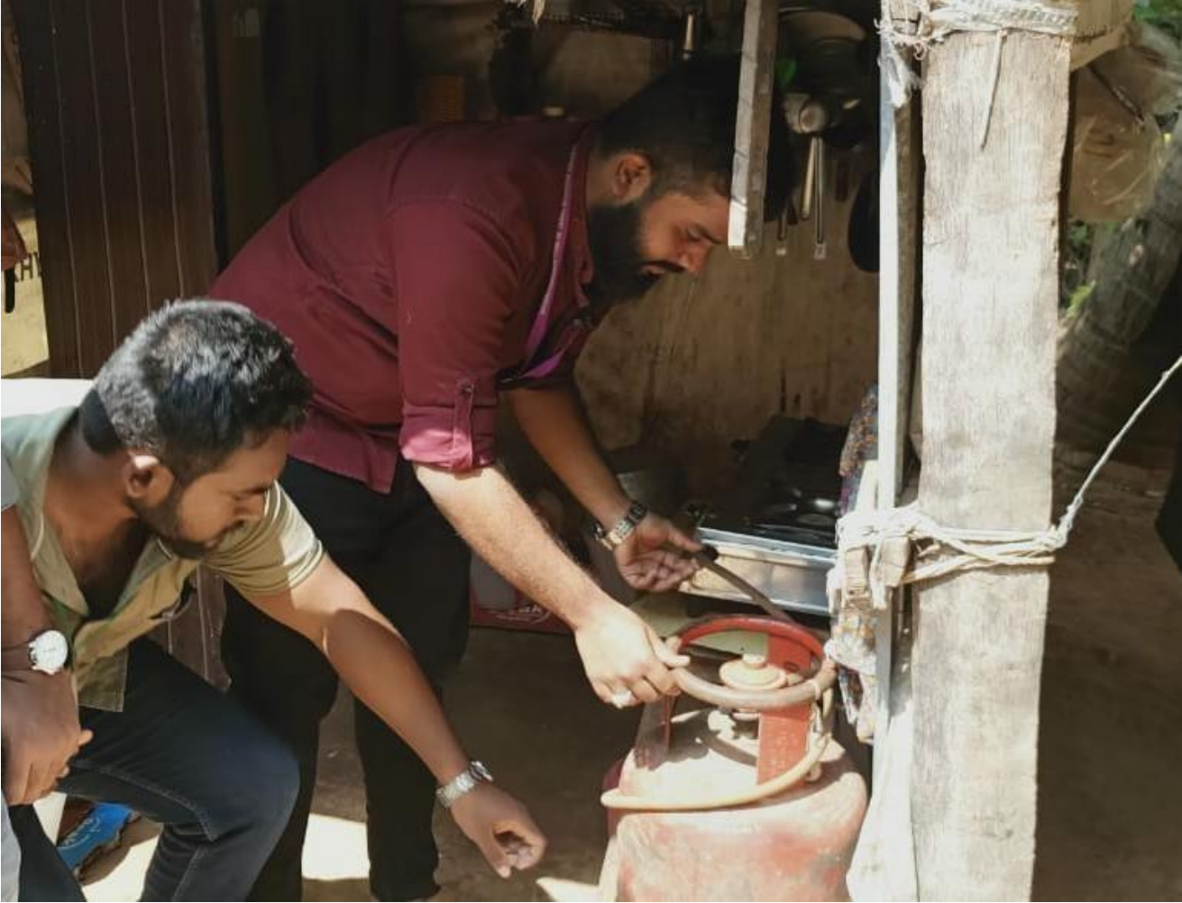
MEMBERS OF OUR CITIZEN CONSUMER CLUB EXAMINING THE CONDITION OF RUBBER PIPE OF CYLINDER IN ONE OF THE HOUSE

The Office bearers of the club along with the volunteers walked every house of the Panchayat and Made awareness about the proper usage of LPG and other safety measures.Around 20 houses under the Manikandam Panchayat were made enlightened about significance of LPG's.Regular checking of the cylinder, Keeping the cylinder off during Non usage period,Proper Maintenance of the rubber tubes, Adva