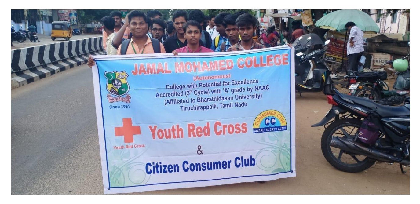
A rally conducted to mark the occasion of world eye sight day by YRC and CCC

VENUE: Joseph eye hospital, Melapudur, Trichy