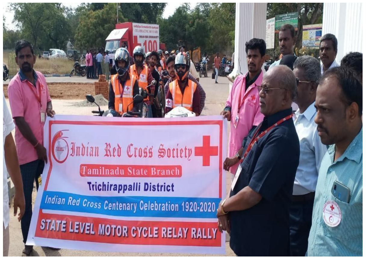
MEMBERS OF INDIAN RED CROSS SOCIETY INAUGURATING THE RALLEY AT DISTRICT COLLECTOR OFFICE

VENUE: District collector office, Tiruchirappali