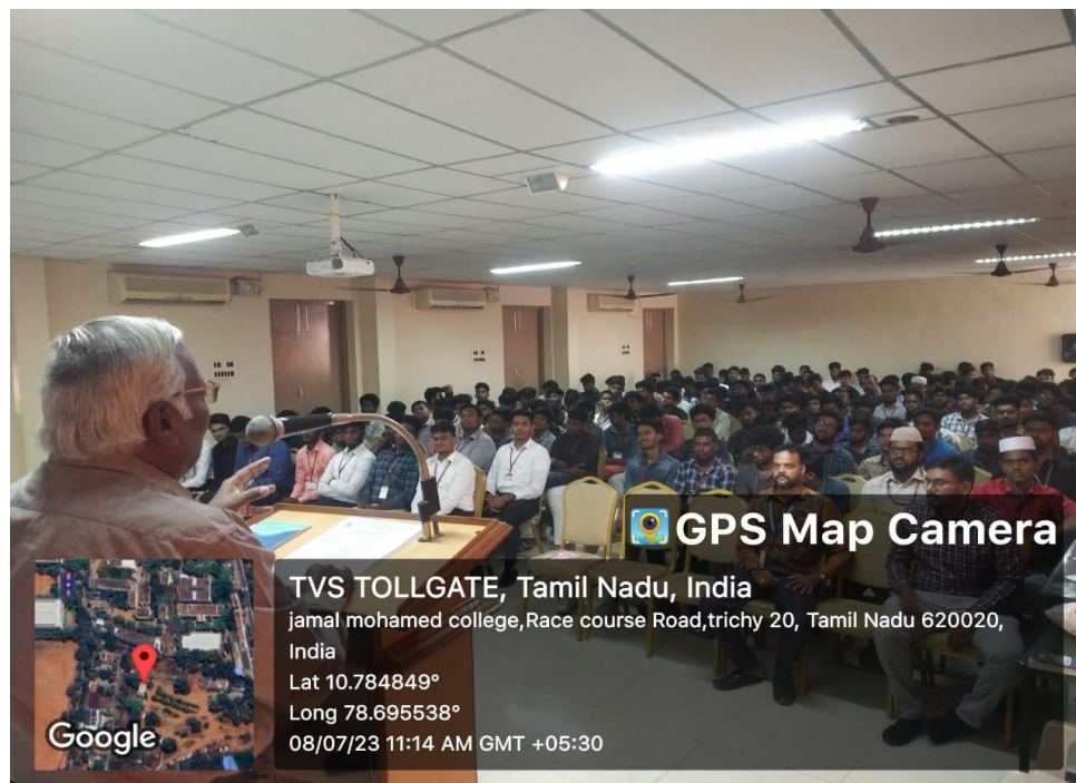
A Glimpse of the audience