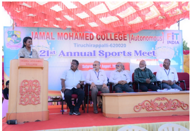
Chief Guest delivers sports day address