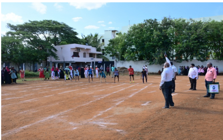
100 Mts run started with gun start by our beloved secretary