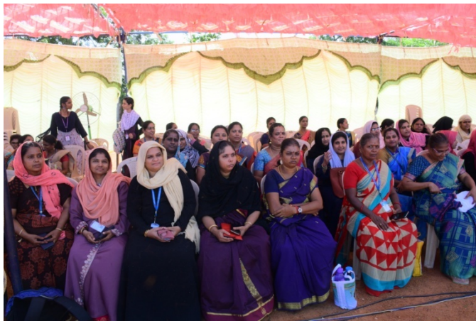
Faculty members viewing in the function