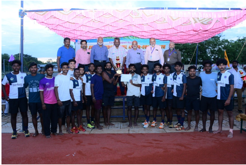
4TH PLACE: Christ College, Kerala