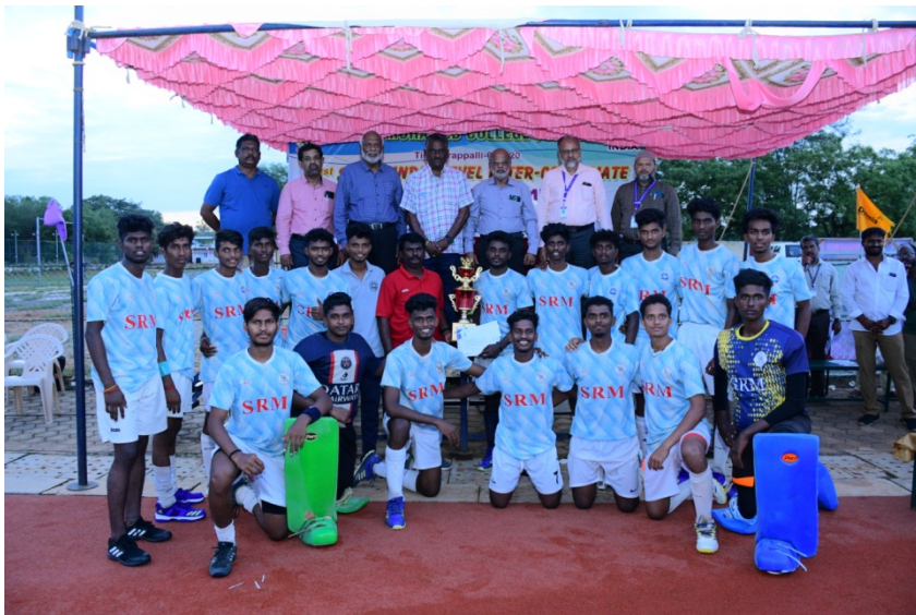
RUNNERS -UP: SRM Arts & Sci. College, Chennai