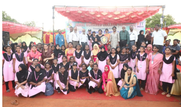
Best March Past goes to NSS