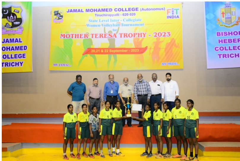
4 TH PLACE: Sadakathullah Appa College, Tirunelveli