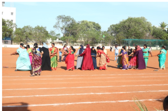
Staff Tug of War