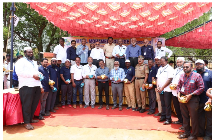
Staff members receiving prizes