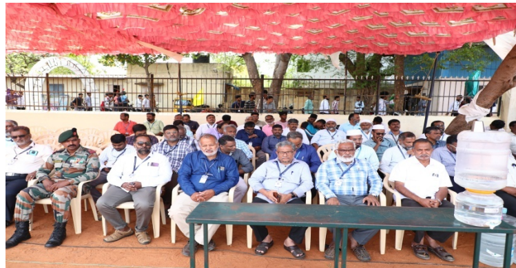
A View of Faculty members in the function