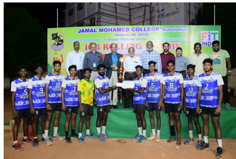
3RD PLACE: Bishop Heber College, Trichy