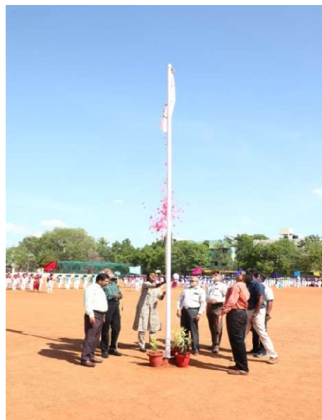
OLYMPIC FLAG HOISTED BY THE CHIEF GUEST