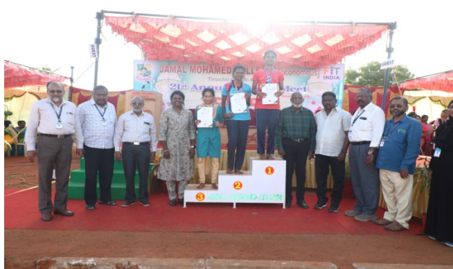
Chief Guest distributes the Prizes