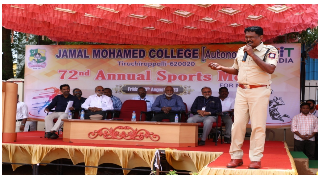
Chief Guest delivers sports day address