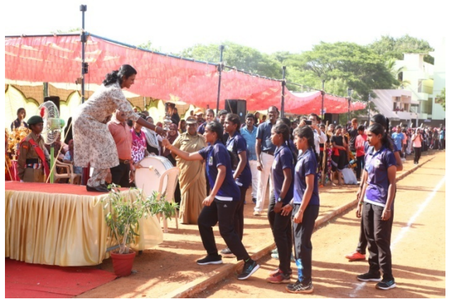
Chief guest receiving the Olympic torch