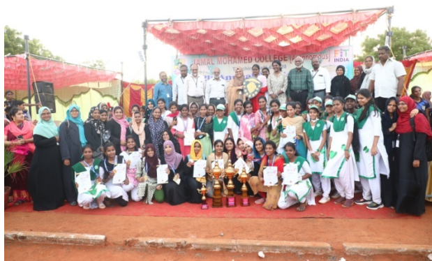
Overall Champion Department of Computer Science