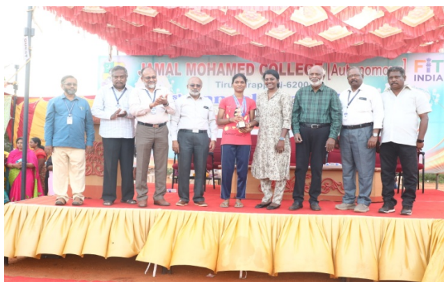
Individual Champion of B.Boomika III B.Com