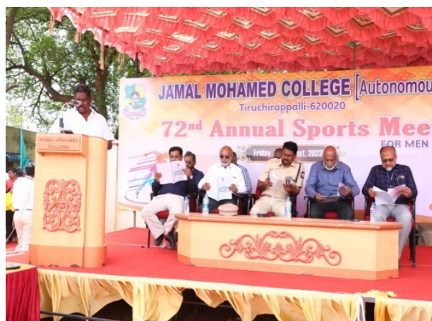
Director of Physical Education Presenting the Annual Report