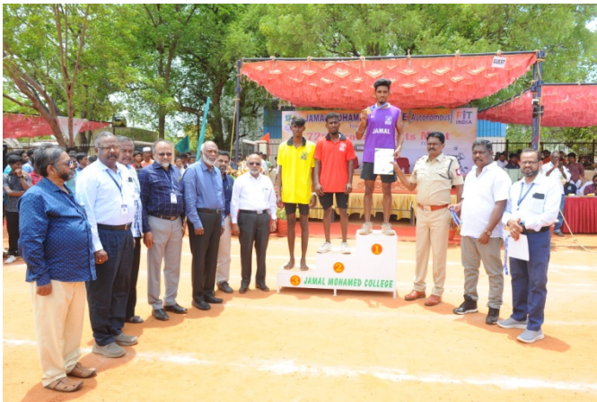
Chief Guest distributes the prizes