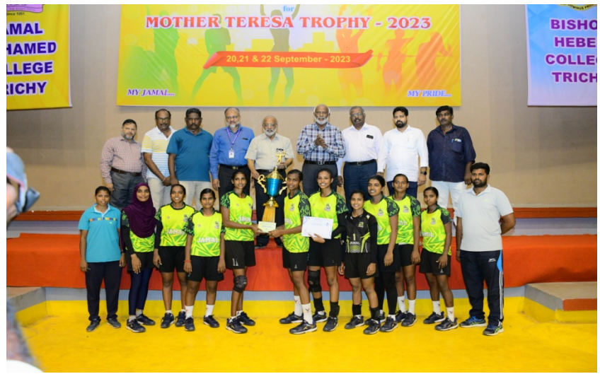
WINNERS: Jamal Mohamed College, Trichy