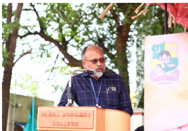
Principal Delivers welcome address