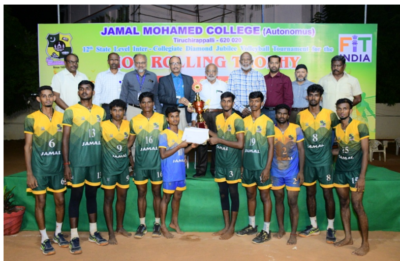
RUNNERS -UP: Jamal Mohamed College, Trichy