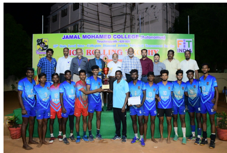
WINNERS: Sacred Heart College, Tirupattur