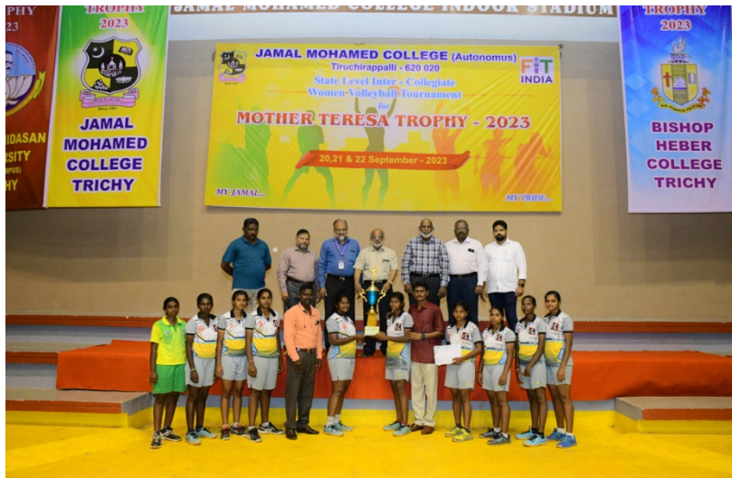
RUNNERS -UP: Sri Sakthi Kailash Women's College, Salem