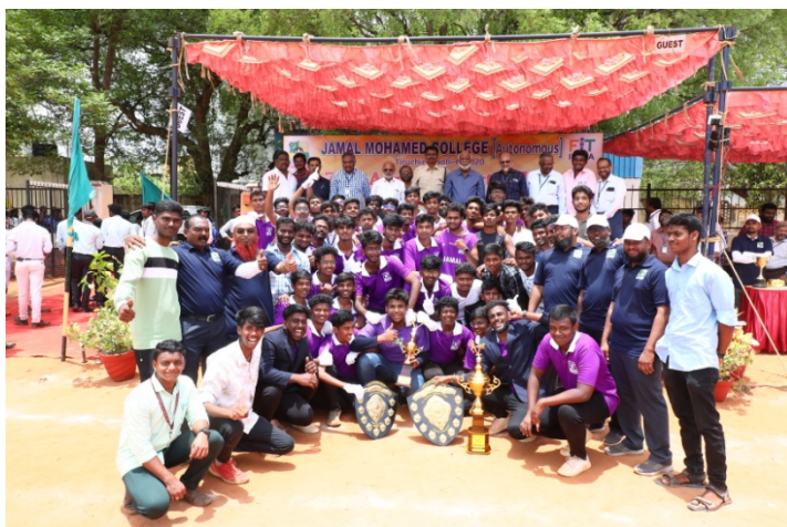
Overall Championship Shield received by BCA Department