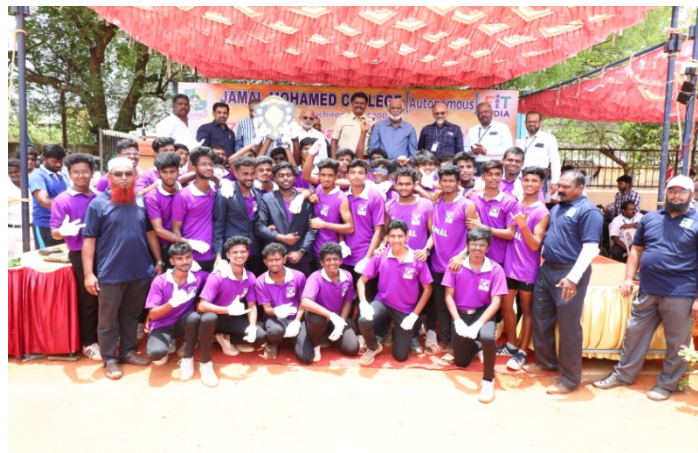
Best March past Contingent BCA Department