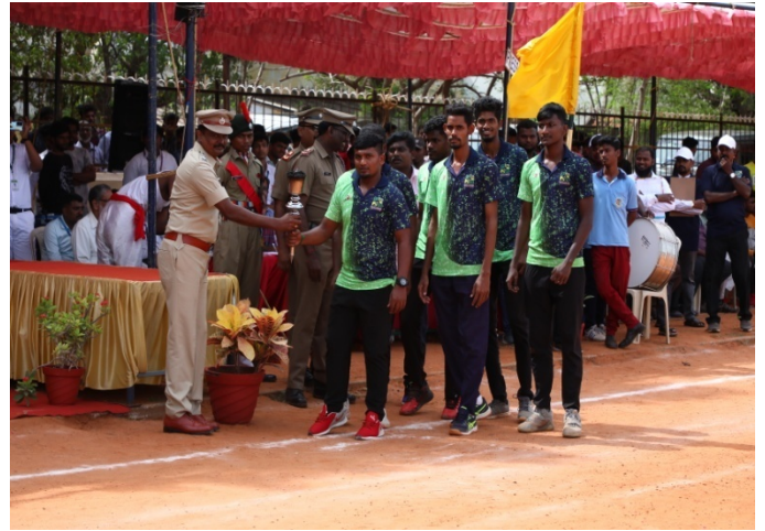
Chief Guest receiving the Olympic torch