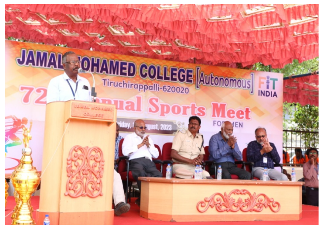
VOTE OF THANKS BY VICE - PRINCIPAL