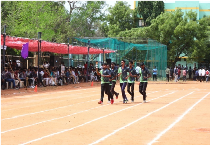
Arrival of the Olympic torch by the team