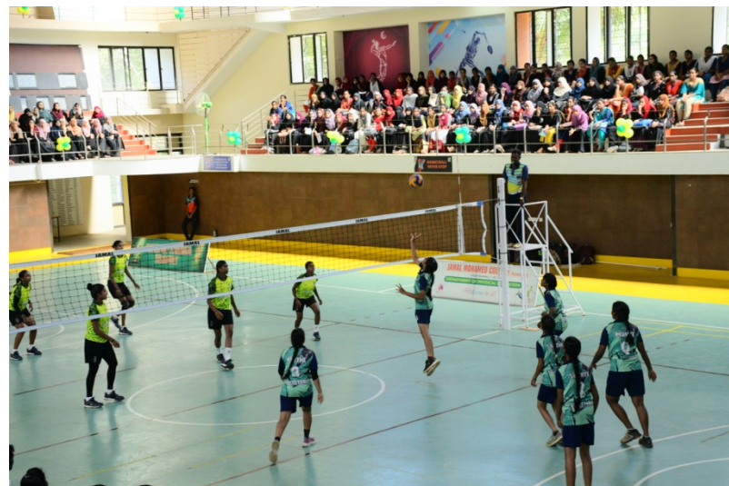
Players in action