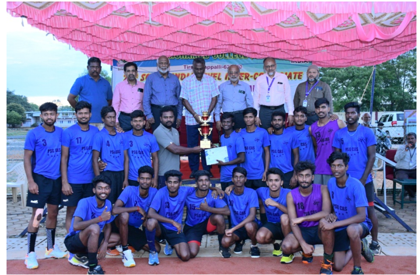
3RD PLACE: PSG College of Arts & Sci., CBE