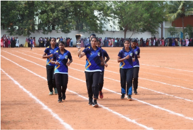
Arrival of the Olympic torch by the team