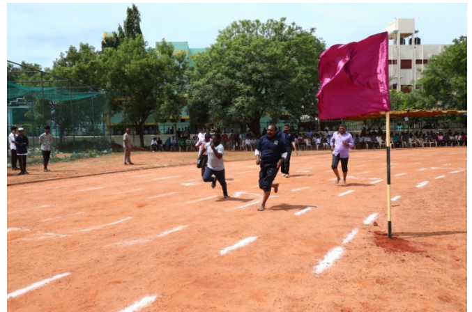
our staff members participating in their events