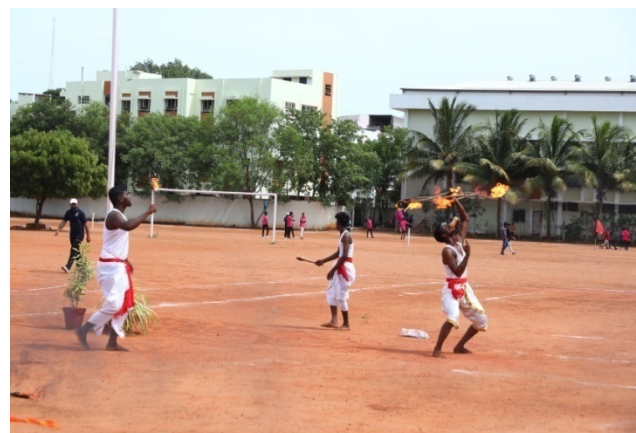
Our students performing silambam and its various position and strategies