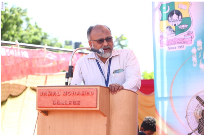
Welcome Address by Principal