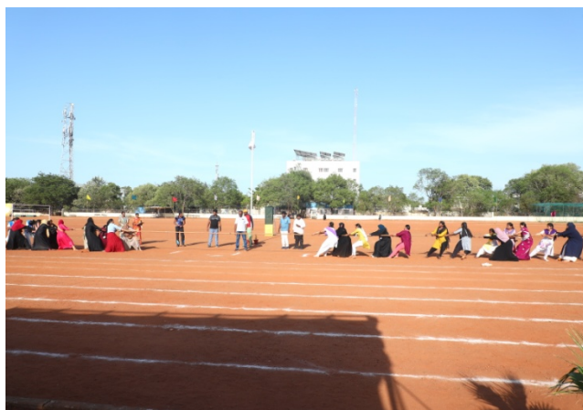
Students Tug of War