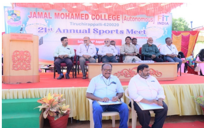
March Past Judges