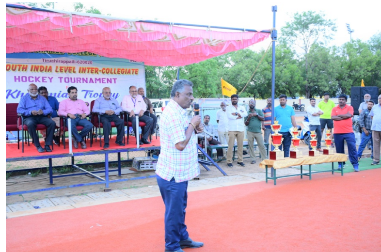
Chief Guest Address to The Players