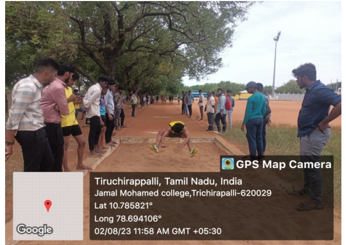
Athletes in action