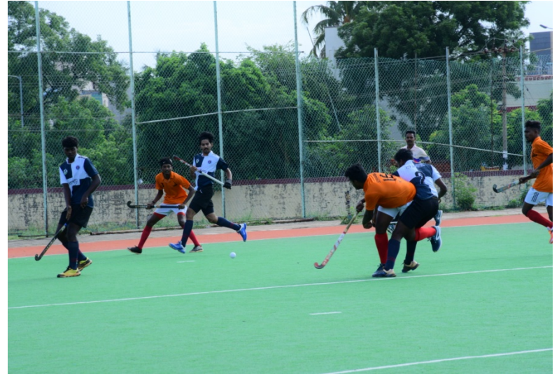
Players in action