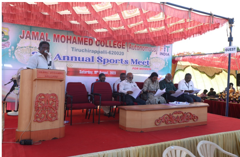
Presentation of Annual Report