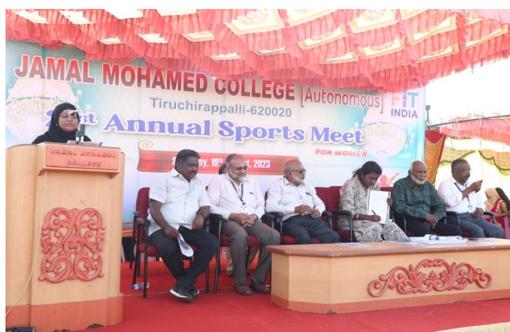
Vote of thanks delivered by the vice principal