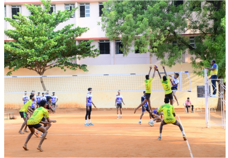
Players in action