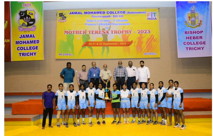
3 RD PLACE: Bishop Heber College, Trichy