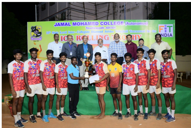
4TH PLACE: St. Joseph's College, Trichy