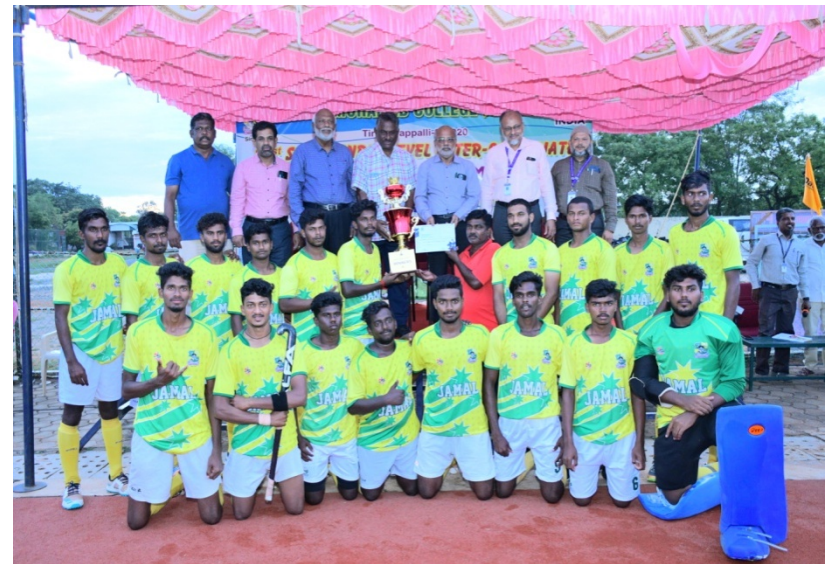
WINNERS: Jamal Mohamed College, Trichy