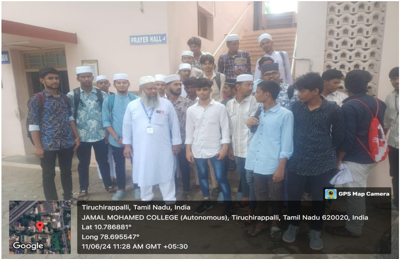
I BA Arabic Students, visiting the Men-Prayer Hall of our Esteemed College