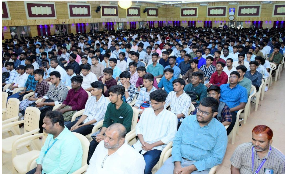
First Year UG Students in the Student Induction Programme