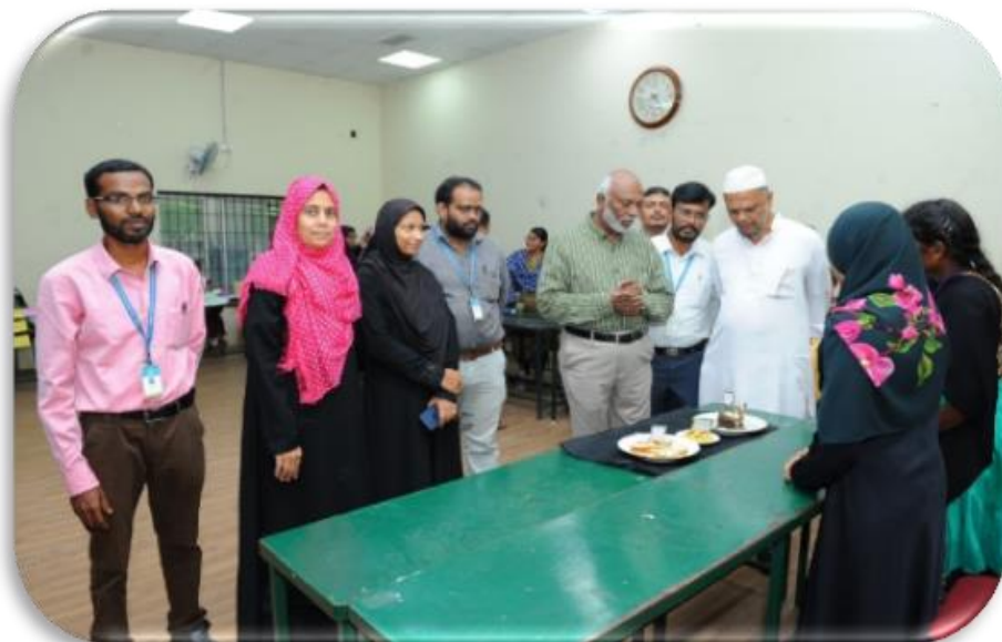
Our Treasurer sahib observes our students' performance with our Additional Vice-Principal and Jury