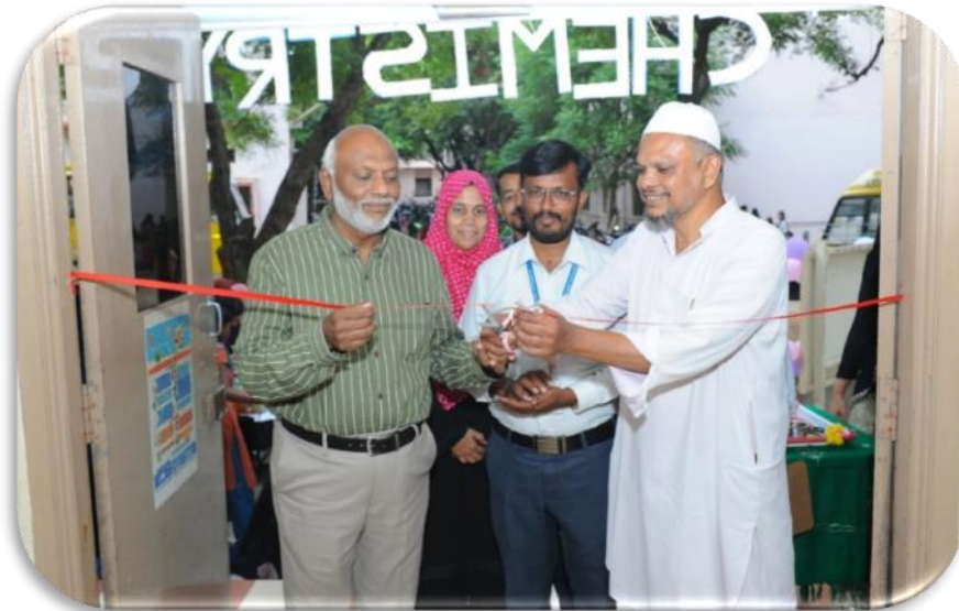
Esteemed Treasurer and Additional Vice-Principal inaugurates the event