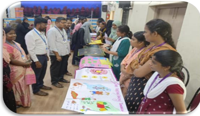
Jury evaluates the event