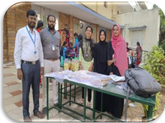
In front of food stall