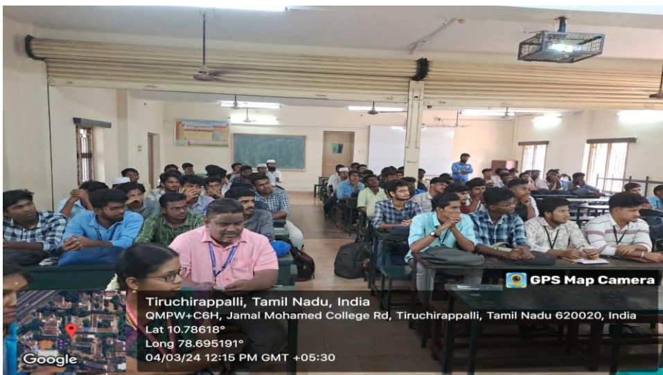
Participants of the B.Ed Awareness Programme