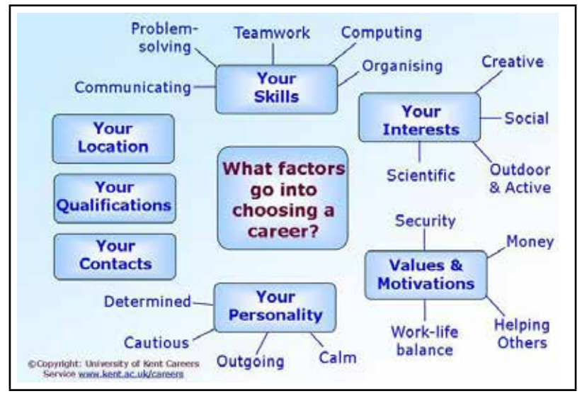
Figure 4: Pictorial representation of components career choices