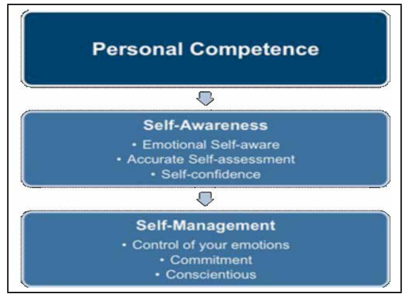
Figure 1: Pictorial representation of components of personal competences

The two major components of personal competence are self-awareness and self-management.