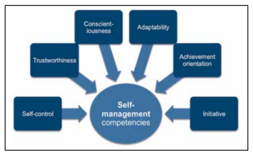
Figure 3: Pictorial representation of components of self-management

The competency of self-management has six different skill attributes: