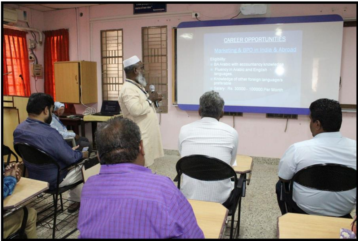
FACULTY OF ARTS DELIVERED POWER POINT PRESENTATION ABOUT “CAREER OPPORTUNITIES AND HIGHER EDUCATION” ON 10.02.2020