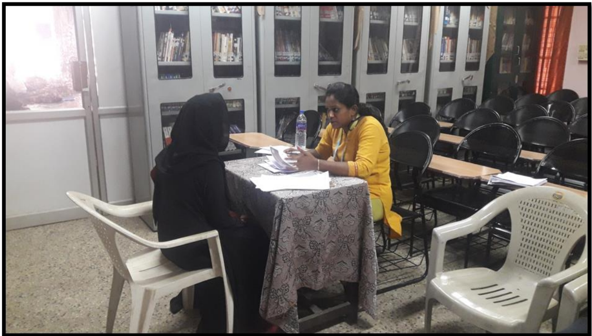
CAPGEMINI CONDUCTS TECHNICAL & HR ROUND ON 20.02.2020