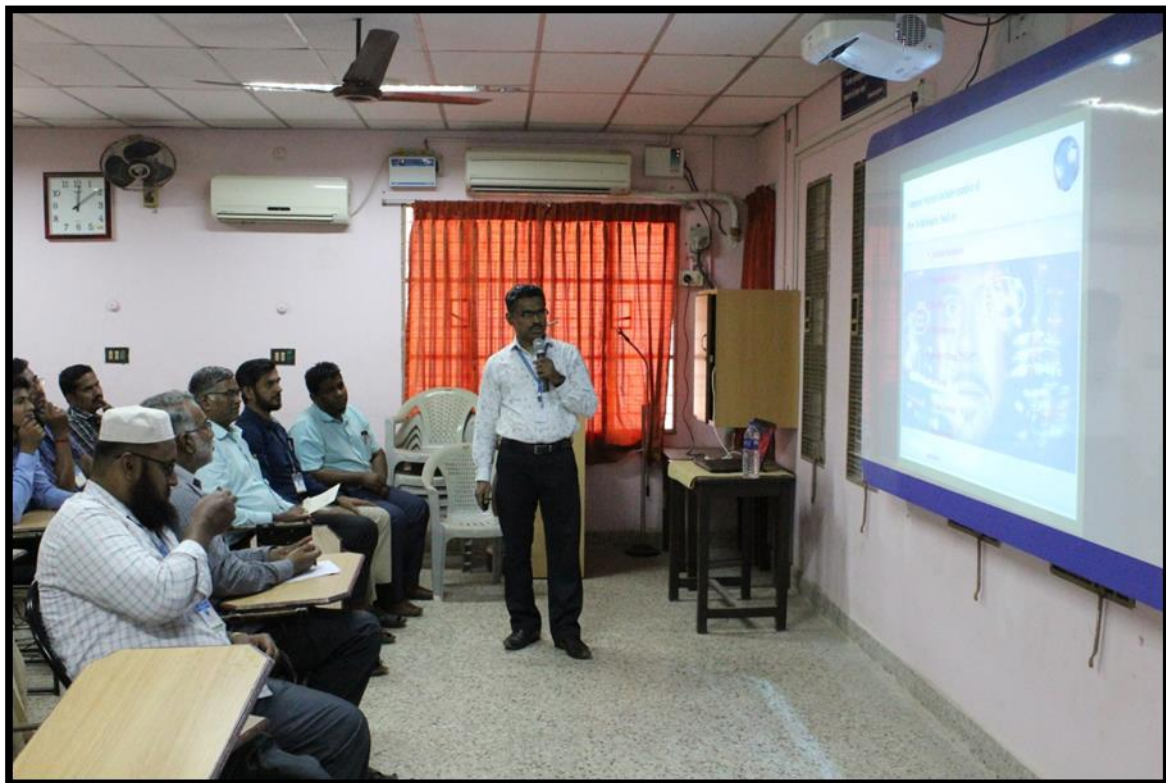
FACULTY OF SCIENCES DELIVERED POWER POINT PRESENTATION ABOUT “CAREER OPPORTUNITIES AND HIGHER EDUCATION” ON 12.02.2020