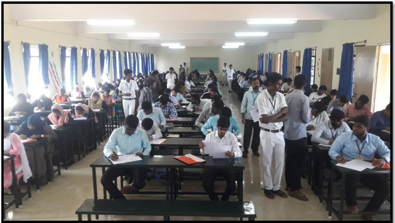
CAPGEMINI CONDUCTS WRITTEN TEST ON 12.12.2019