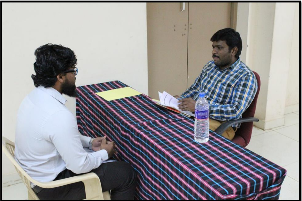
HCL CONDUCTS TECHNICAL & HR INTERVIEW ON 31.01.2020