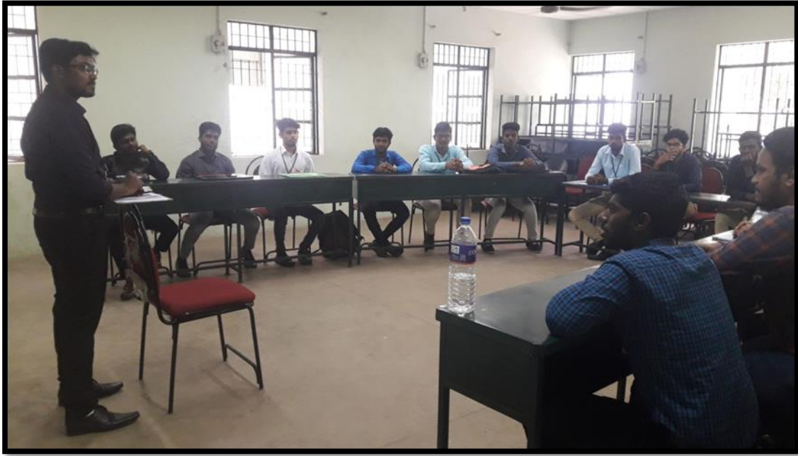
VDART CONDUCTS GROUP DISCUSSION ON 26.02.2020