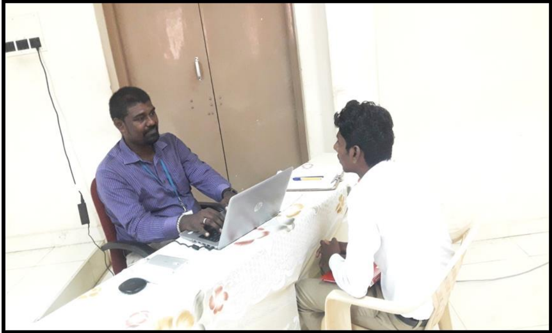
WIPRO CONDUCTS TECHNICAL & HR INTERVIEW ON 17.02.2020