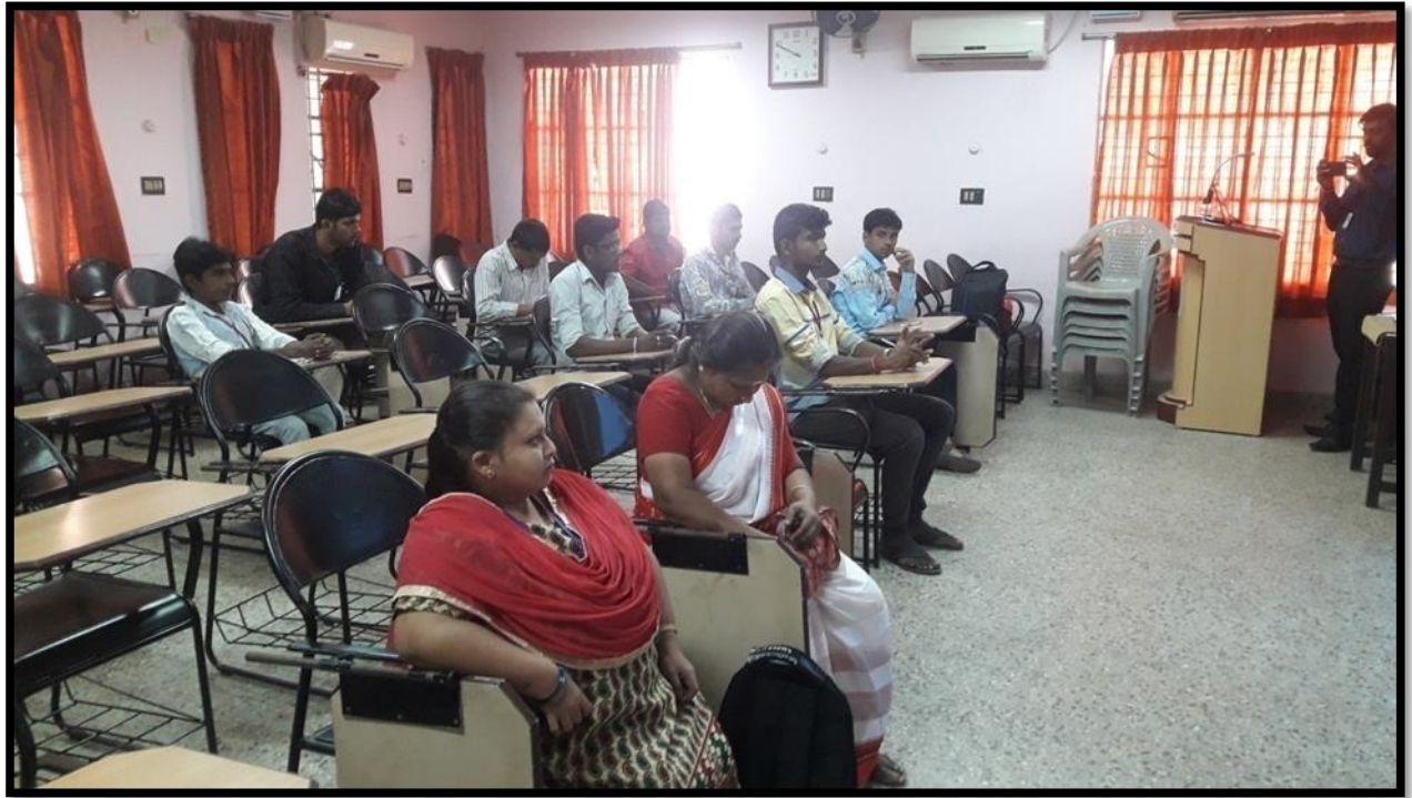
YOUTH4JOBS CONDUCTED CAREER GUIDANCE WORKSHOP FOR DIFFERENTLY ABLED STUDENTS ON 18.02.2020