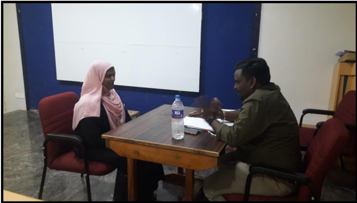
VDART CONDUCTS TECHNICAL & HR ROUND ON 26.02.2020