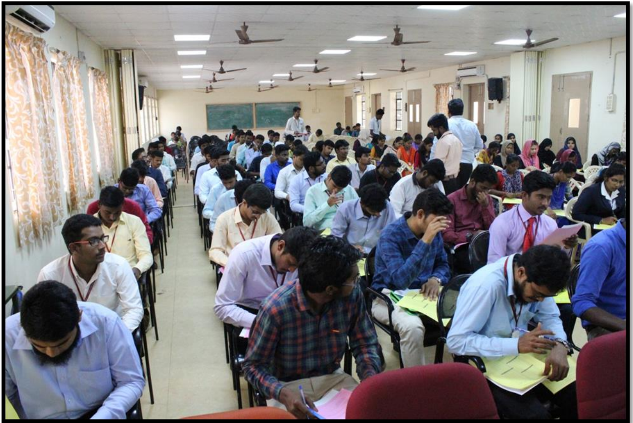
HCL CONDUCTS WRITTEN TEST ON 31.01.2020