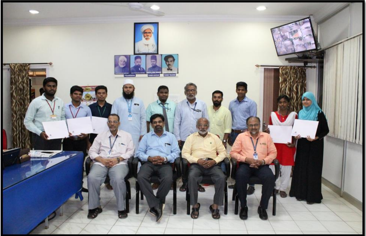
ATMECS SELECTED CANDIDATES WITH OFFER LETTER