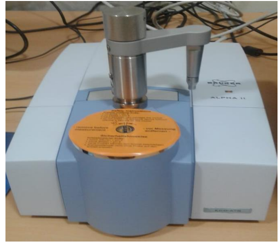
b. IR Spectrometer unit