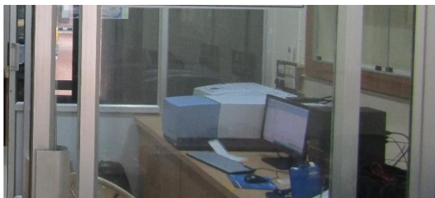
a. Entire Unit