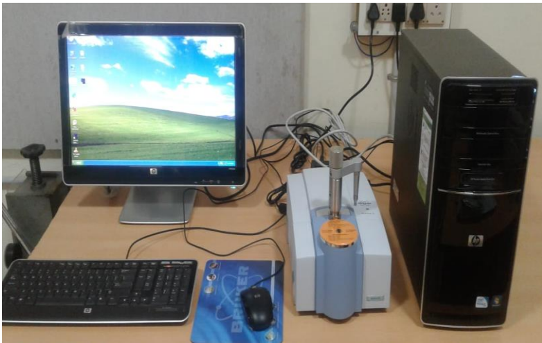
a. Entire Unit