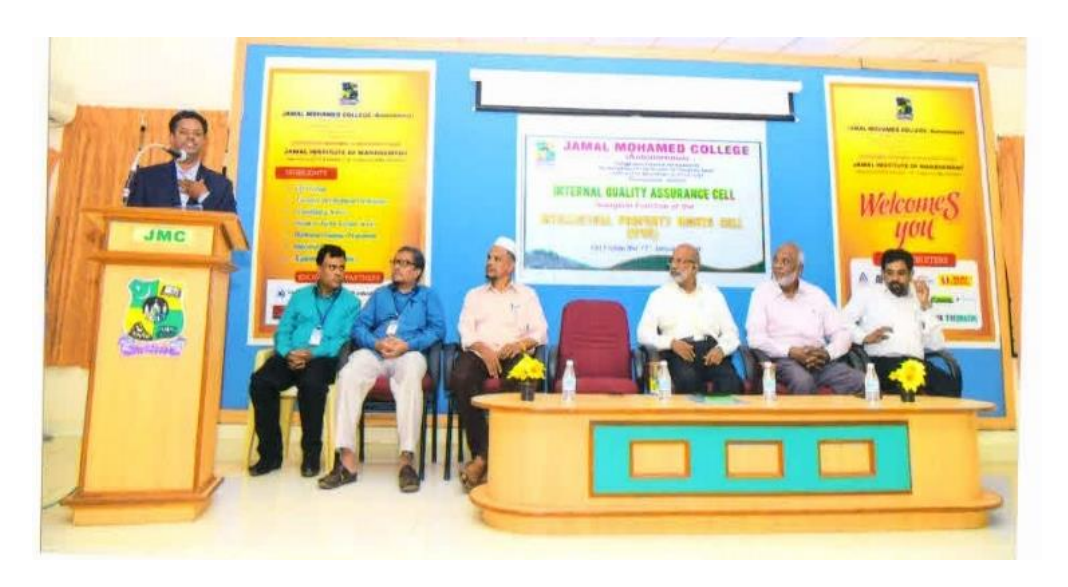
Special Guest Address