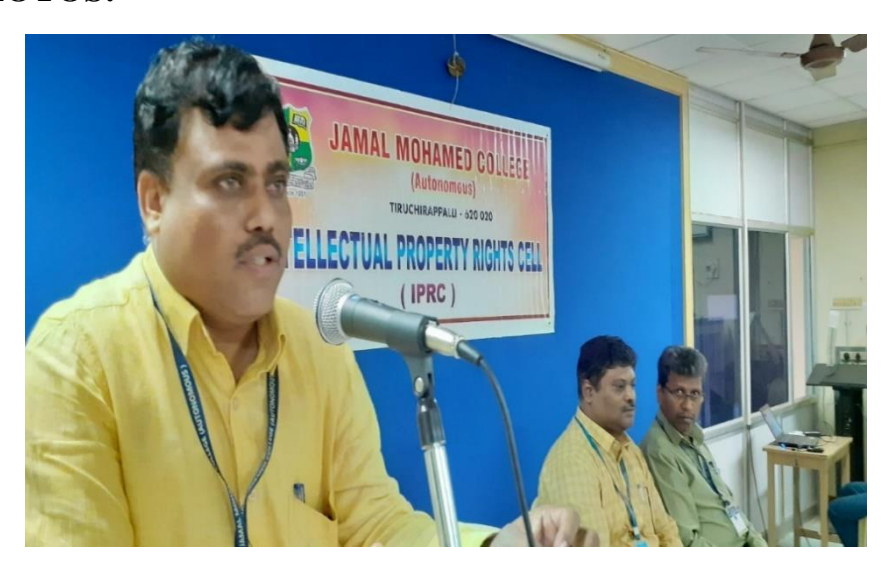
Welcome Address by Coordinator of IPR cell