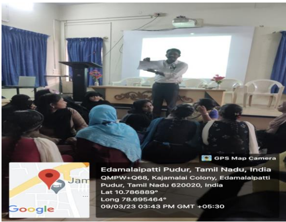
Edamalaipatti Pudur, Tamil Nadu, India QMPW+Q68, Kajamalai Colony, Edamalaipatti Pudur, Tamil Nadu 620020, India Lat 10.786889° Long 78.695464° 09/03/23 03:43 PM GMT +05:30