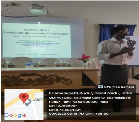
Edamalaipatti Pudur, Tamil Nadu, India QMPW+Q68, Kajamalai Colony, Edamalaipatti Pudur, Tamil Nadu 620020, India Lat 10.786896° Long 78.695482° 09/03/23 03:18 PM GMT +05:30