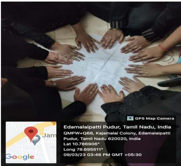
Edamalaipatti Pudur, Tamil Nadu, India QMPW+Q68, Kajamalai Colony, Edamalaipatti Pudur, Tamil Nadu 620020, India Lat 10.786906° Long 78.695511° 09/03/23 03:46 PM GMT +05:30