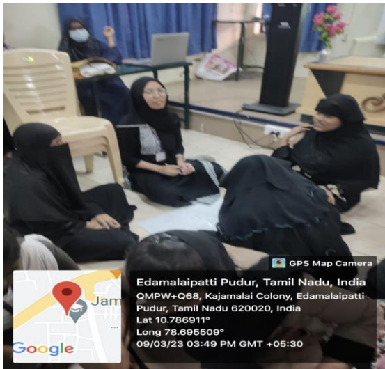
Edamalaipatti Pudur, Tamil Nadu, India QMPW+Q68, Kajamalai Colony, Edamalaipatti Pudur, Tamil Nadu 620020, India Lat 10.786911° Long 78.695509° 09/03/23 03:49 PM GMT +05:30