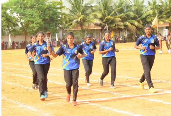
Arrival of the Olympic torch by the team