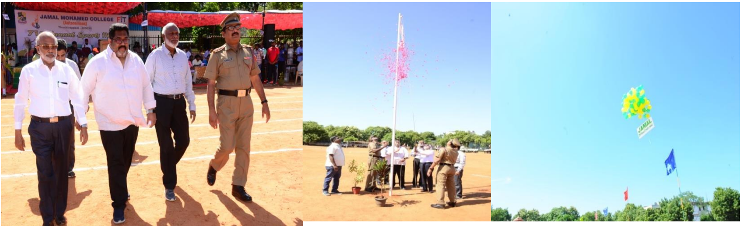
OLYMPIC FLAG HOISTED BY THE CHIEF GUEST & A VIEW OF THE BALLOONS GALLOPING IN THE SKY