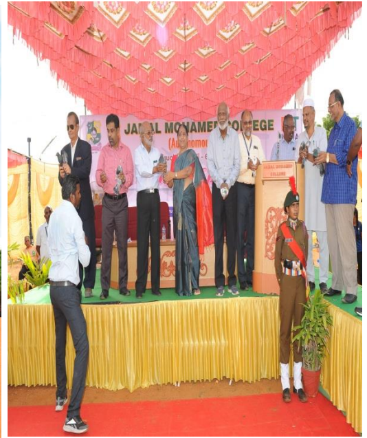
Pigeons are let off in the Sky