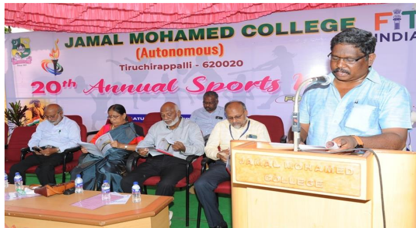
Presentation of Annual Report