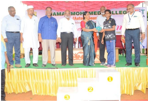
Chief Guest distributes the Prizes