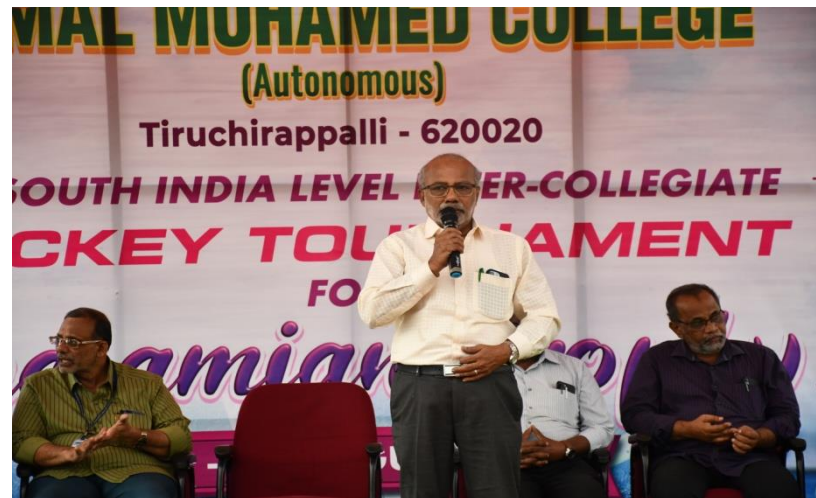
Our Secretary Address to The Players