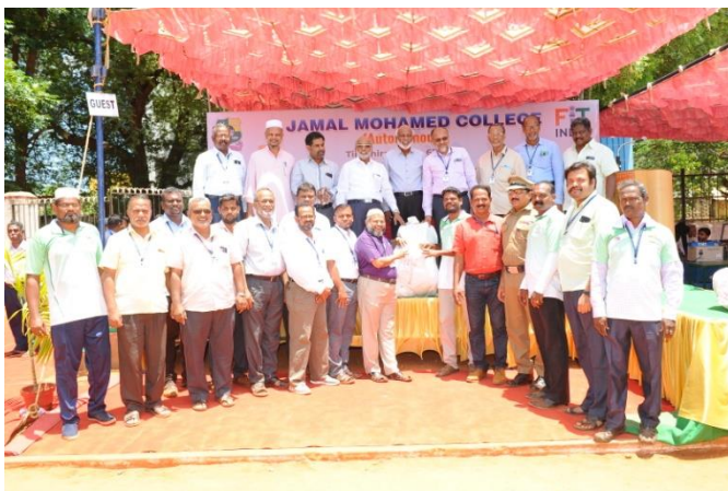
Staff members receiving prizes