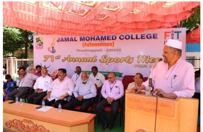
VOTE OF THANKS BY ADDL VICE - PRINCIPAL