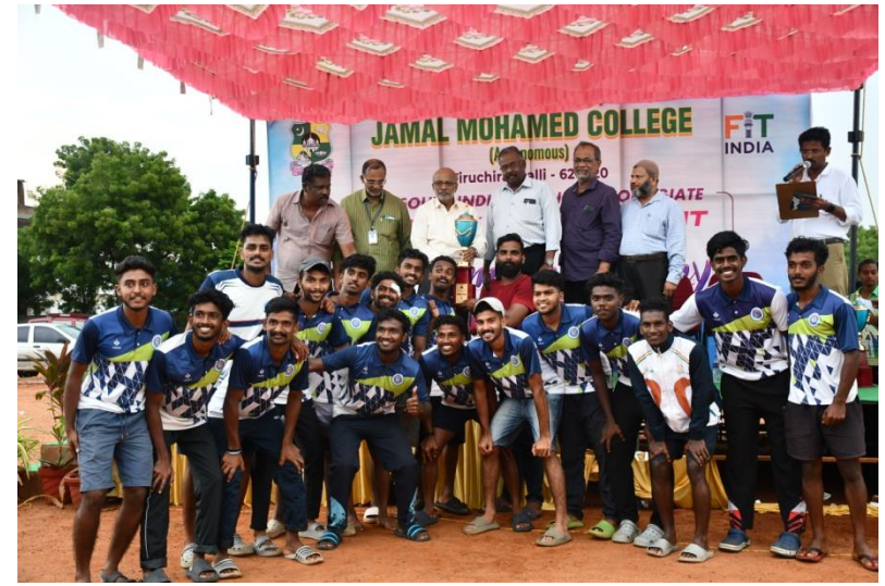
3RD PLACE: Christ College, Kerala