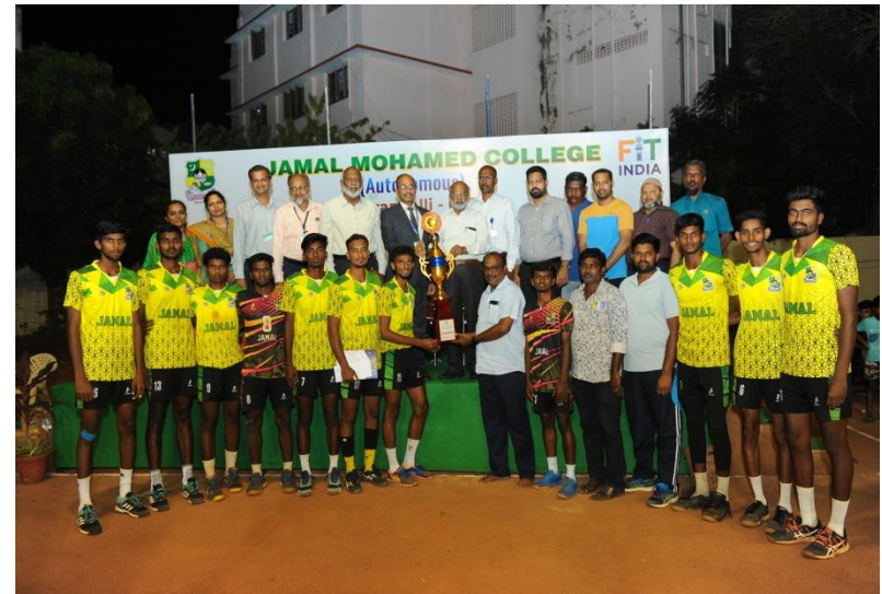
WINNERS: Jamal Mohamed College, Trichy