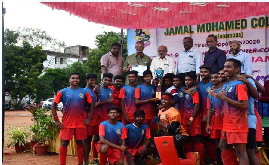
RUNNERS -UP: Arul Anandar College, Madurai