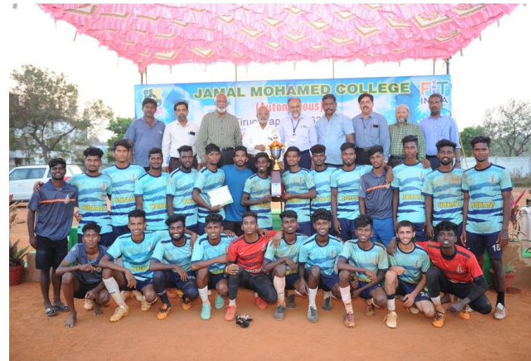
WINNERS: Bishop Heber College, Trichy