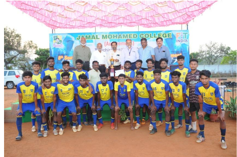
3RD PLACE: PSG College of Arts & Sci, CBE