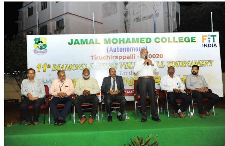
Our Secretary Address to The Players