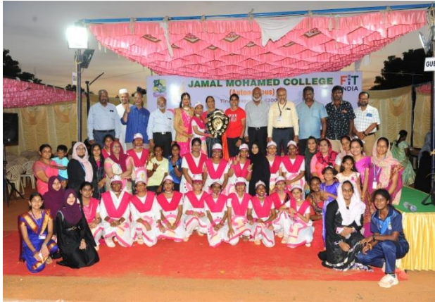
Overall Champion Department of English