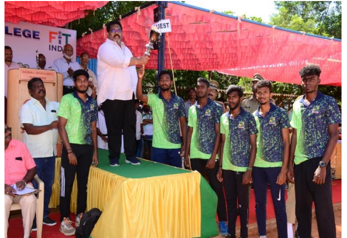
Chief Guest receiving the Olympic torch