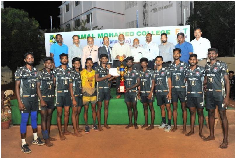
RUNNERS -UP: Sacred Heart College, Tirupattur