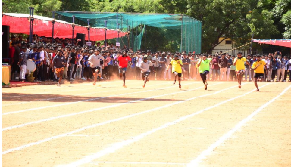
Athletes in action