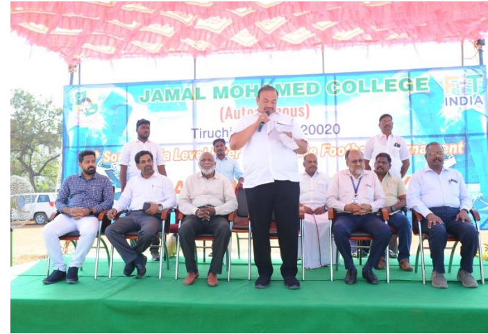
Dr.S.Inigo Irudayaraj Member of Legislative Assembly Tiruchirappalli East Constituency