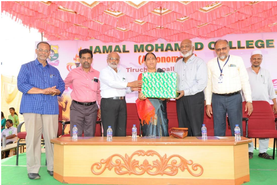
Our Secretary and Treasurer Honour the Chief Guest by Presenting a Memento