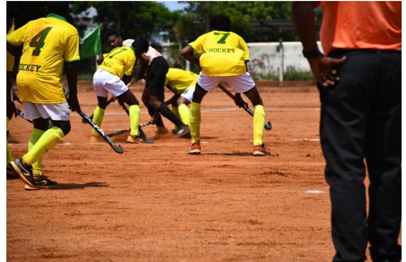
Players in action