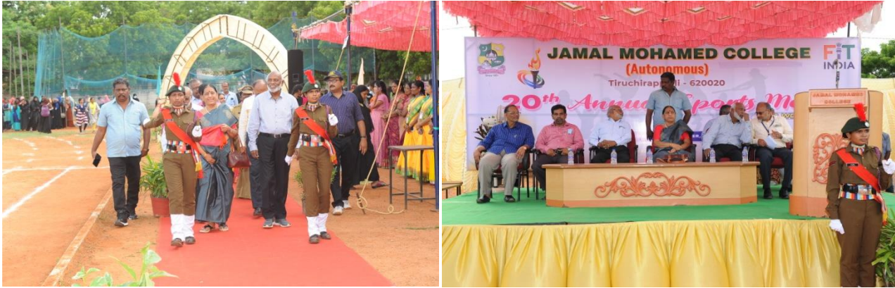
CHIEF GUEST ARRIVING FOR THE FUNCTION