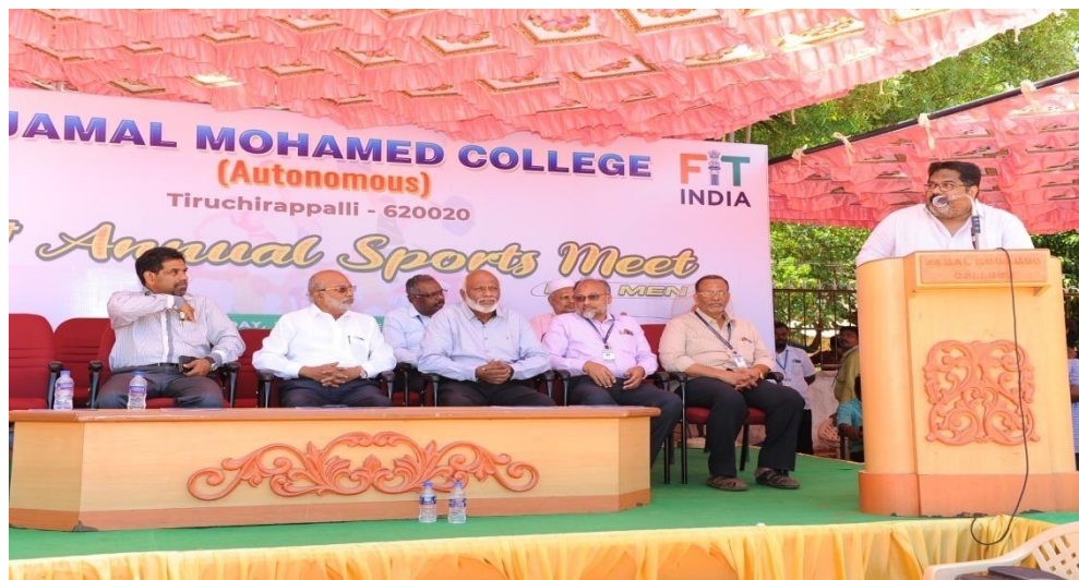
Chief Guest delivers sports day address