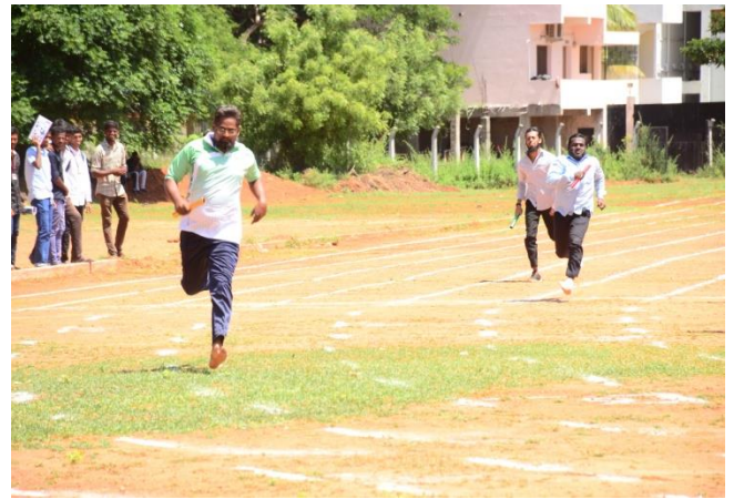
our staff members participating in their events