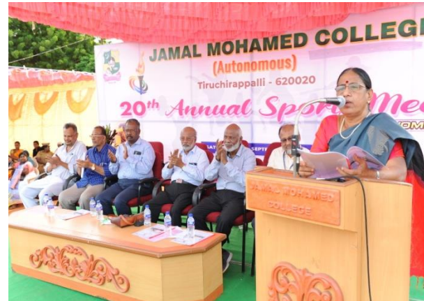
Chief guest delivers sports day address