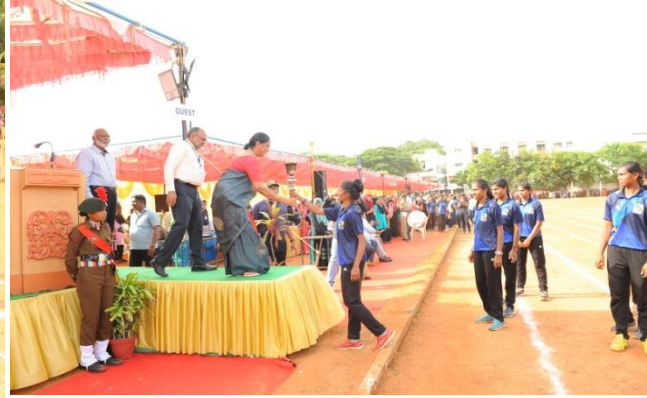
Chief guest receiving the Olympic torch