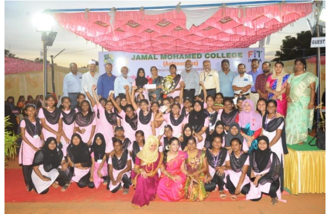
Best March Past goes to NSS