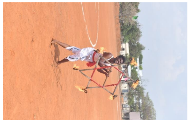
Our students performing silambam and its various position and strategies