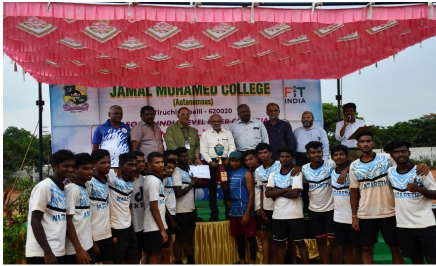
4TH PLACE: Nazareth College of Arts & Science, Chennai