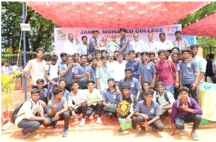
Overall Championship Shield received by BCA Department