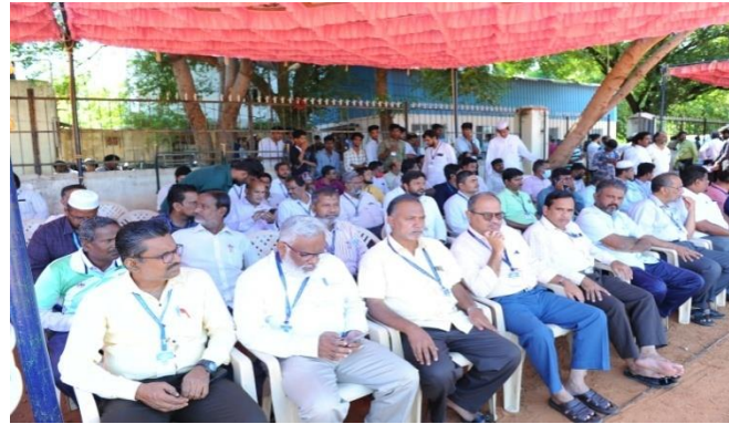
A View of Faculty members in the function