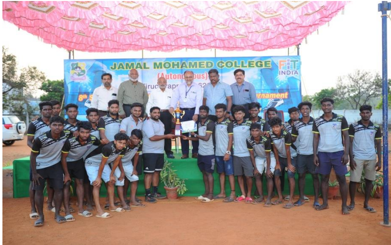
4TH PLACE: St.Joseph's College, Trichy