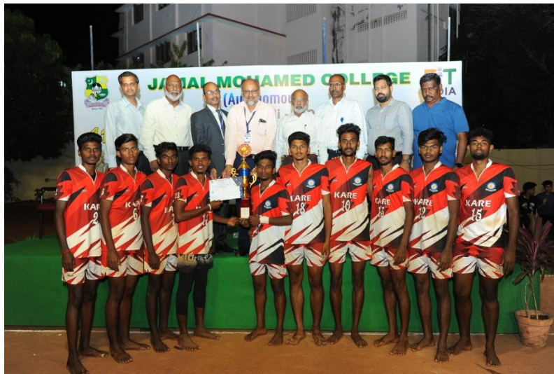
4 TH PLACE: Kalasalingam University, Krishnankoil