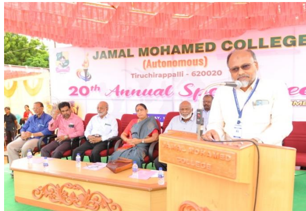
Welcome Address by Principal