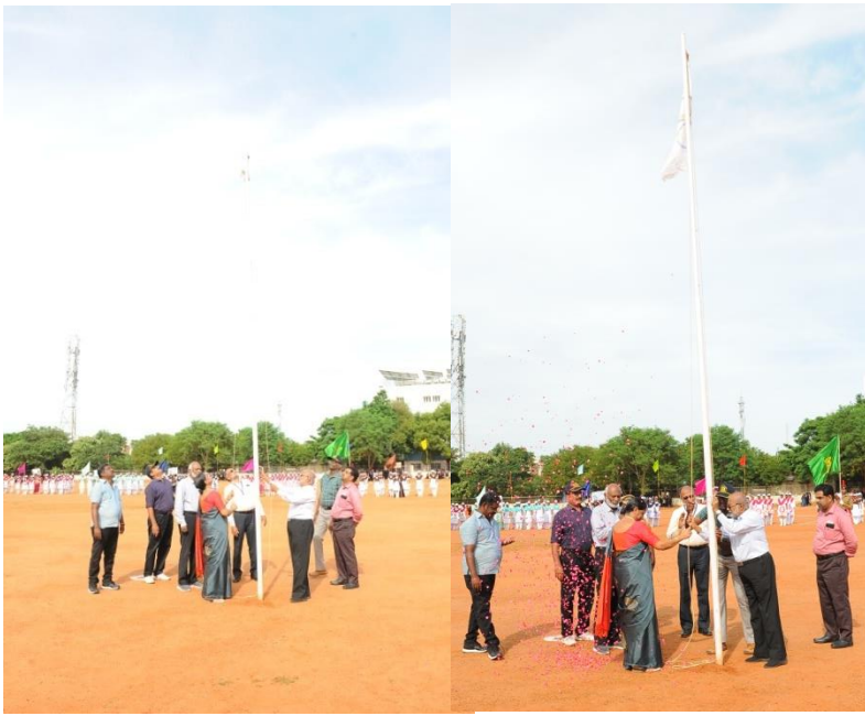
OLYMPIC FLAG HOISTED BY THE CHIEF GUEST