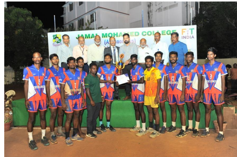
3 RD PLACE: Sathyabama University, Chennai