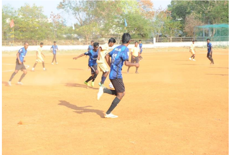
Players in action