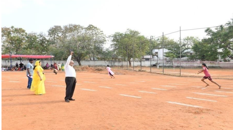
400 Mts Relay run started with gun start by our beloved secretary