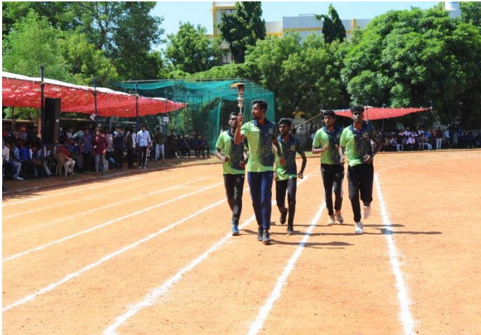
Arrival of the Olympic torch by the team