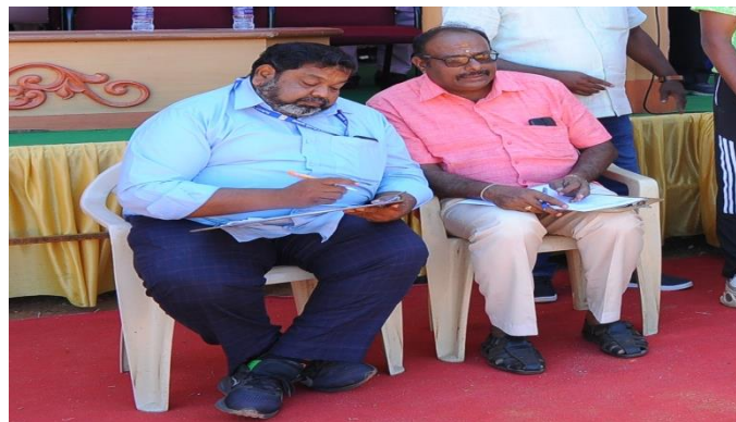
March Past Judges