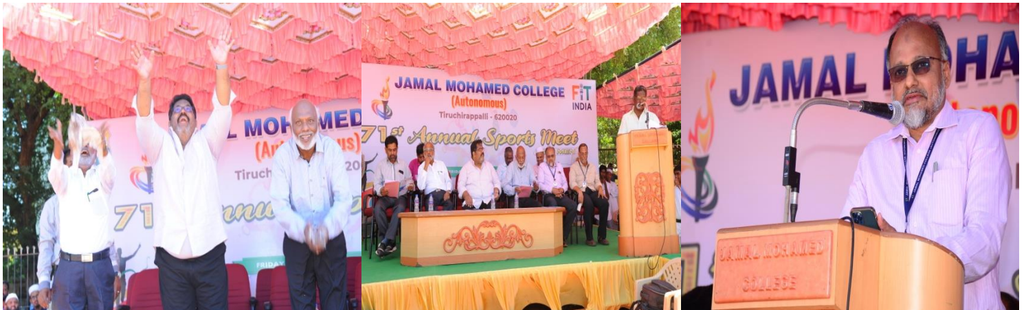
Pigeons are let off in the Sky