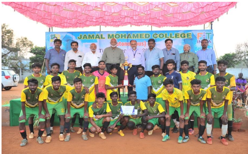
RUNNERS -UP: Jamal Mohamed College, Trichy