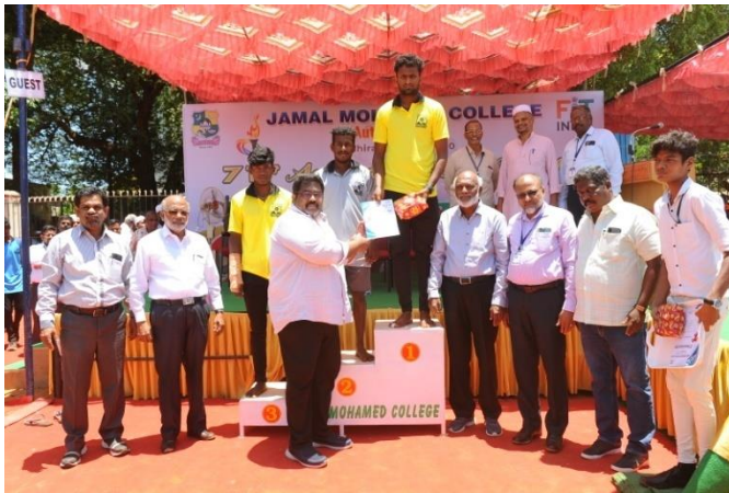
Chief Guest distributes the prizes