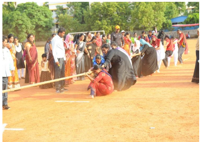
Students Tug of War