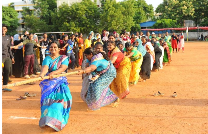
Staff Tug of War