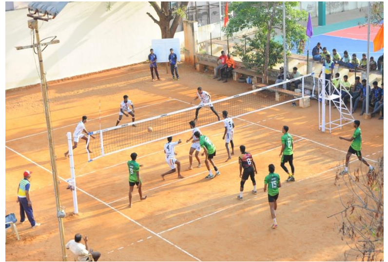
Players in action