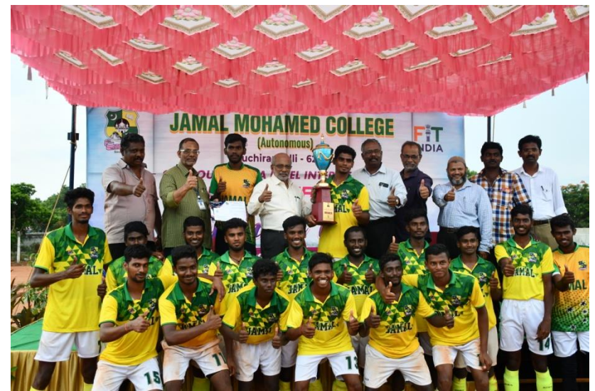
WINNERS: Jamal Mohamed College, Trichy