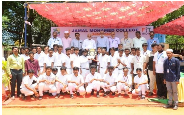
Best March past Contingent NSS