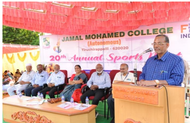
Vote of thanks delivered by the vice principal