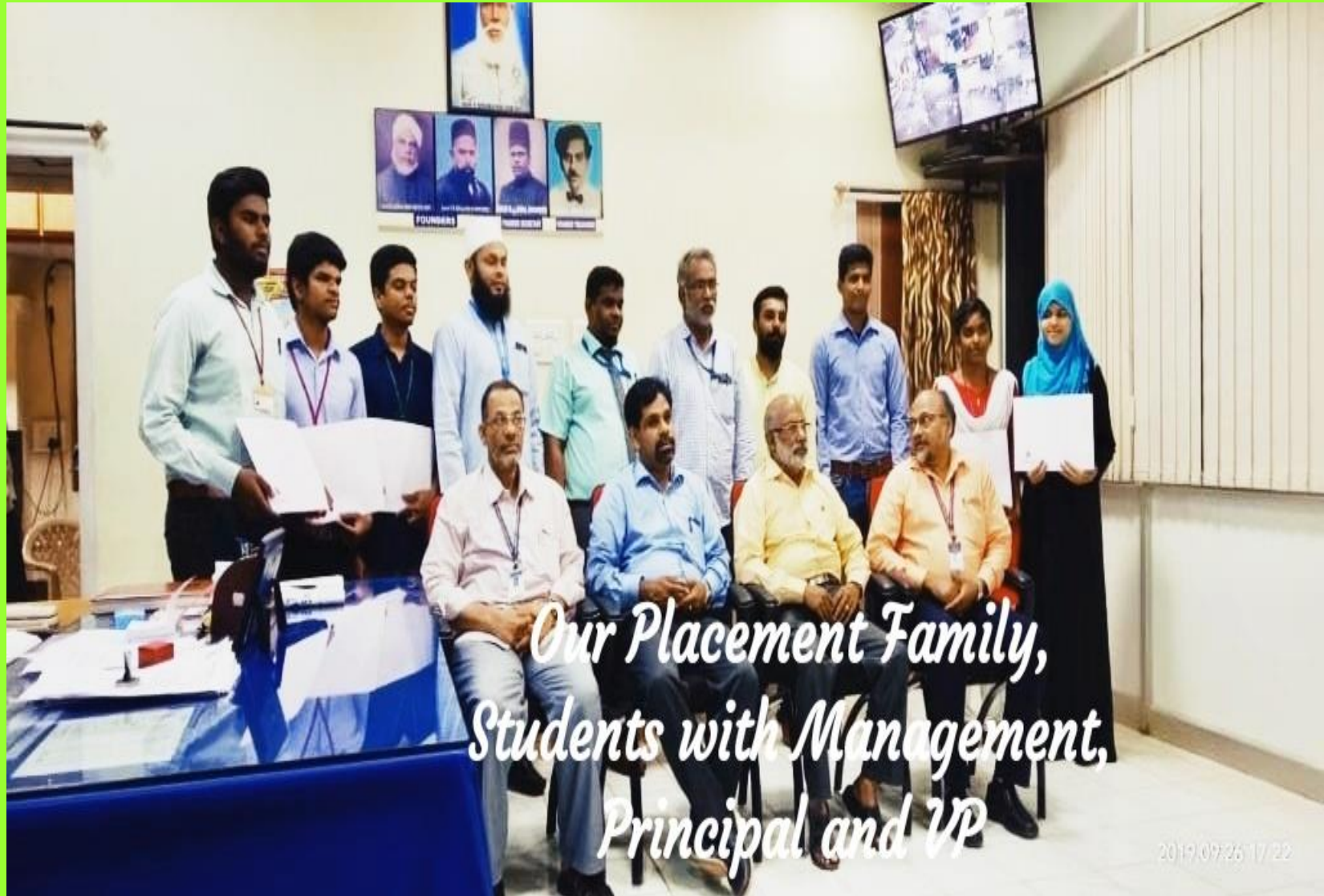
Our Placement Family, Students with Management, Principal and VP