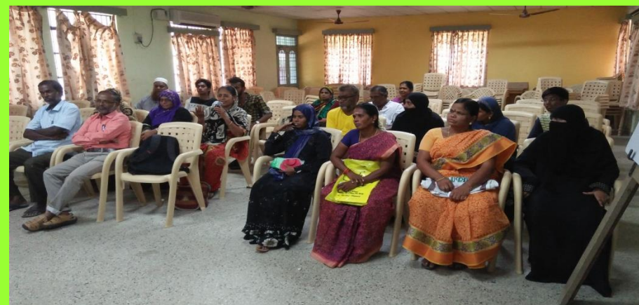
The Parents of both B.Sc. and MCA students