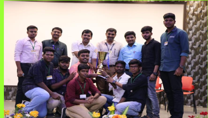
Won the Overall Championship Award in Spyder 2K19 Technical Symposium conducted by Hindustan College of Arts & Science, Coimbatore on 26-09-2019