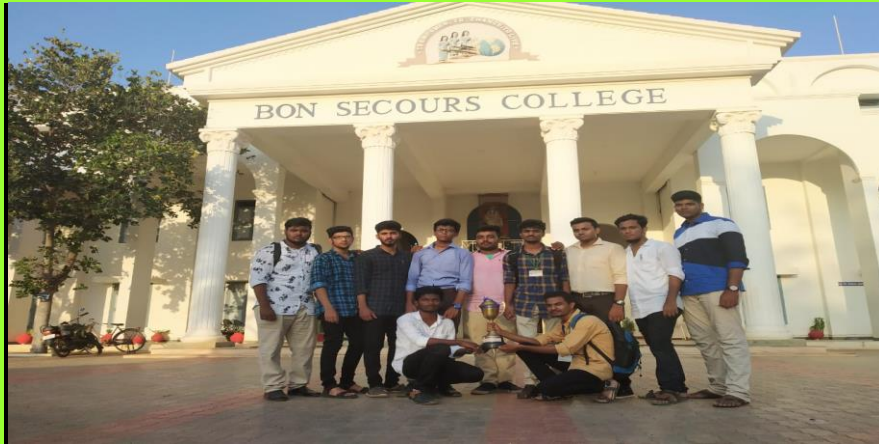
Won the Overall Championship Award in Renova' 20 Technical Symposium conducted by Bon Secours College, Thanjavur on 14-09-2019