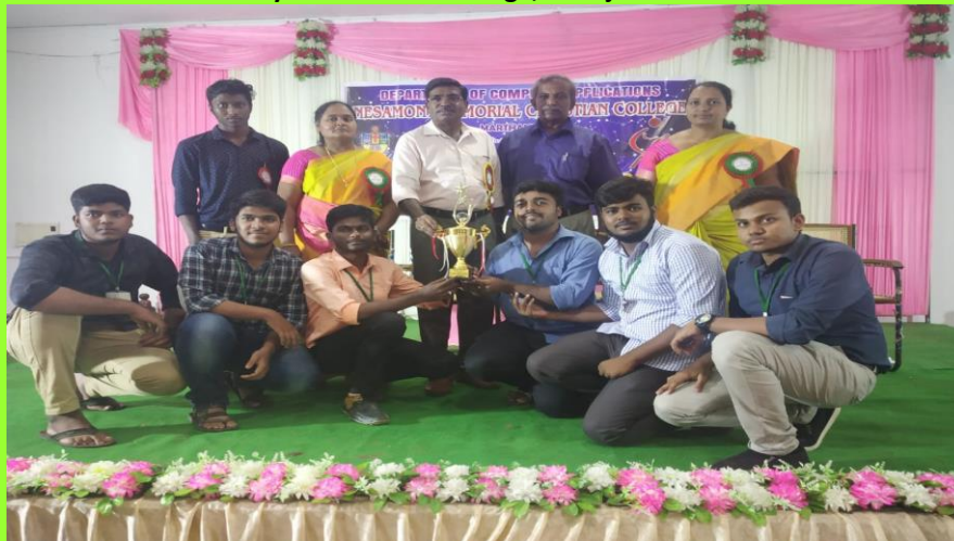
Won the Overall Championship Award in Boot 2K19 Technical Symposium conducted by Nesamony Memorial College, Marthandam on 25-09-2016