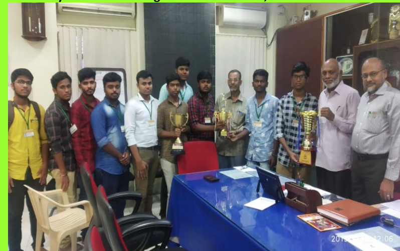
Glorious moment of Our B.Sc. CS Students with our Treasurer and Principal