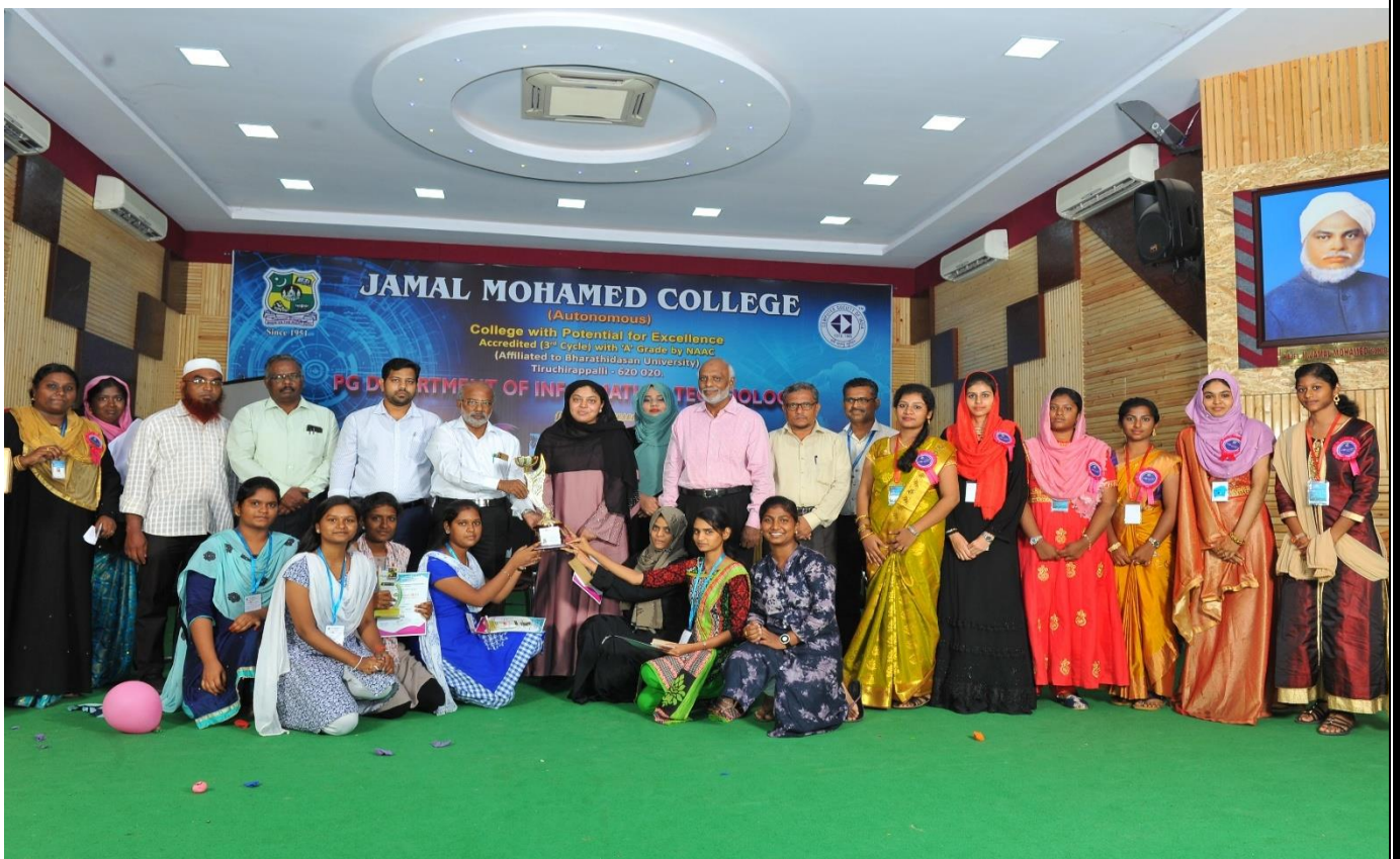
Overall Trophy won by Holy Cross College, Trichy.