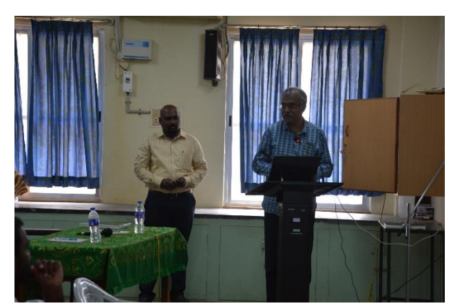
External examiner concluding the session