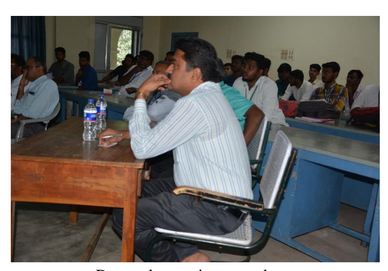
Doctoral committee members, Faculty, Research scholars and Students observing her research findings