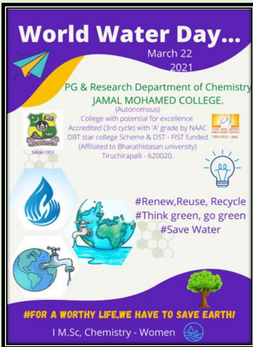
Releasing Awareness Video by Department of Chemistry (SF-Women)