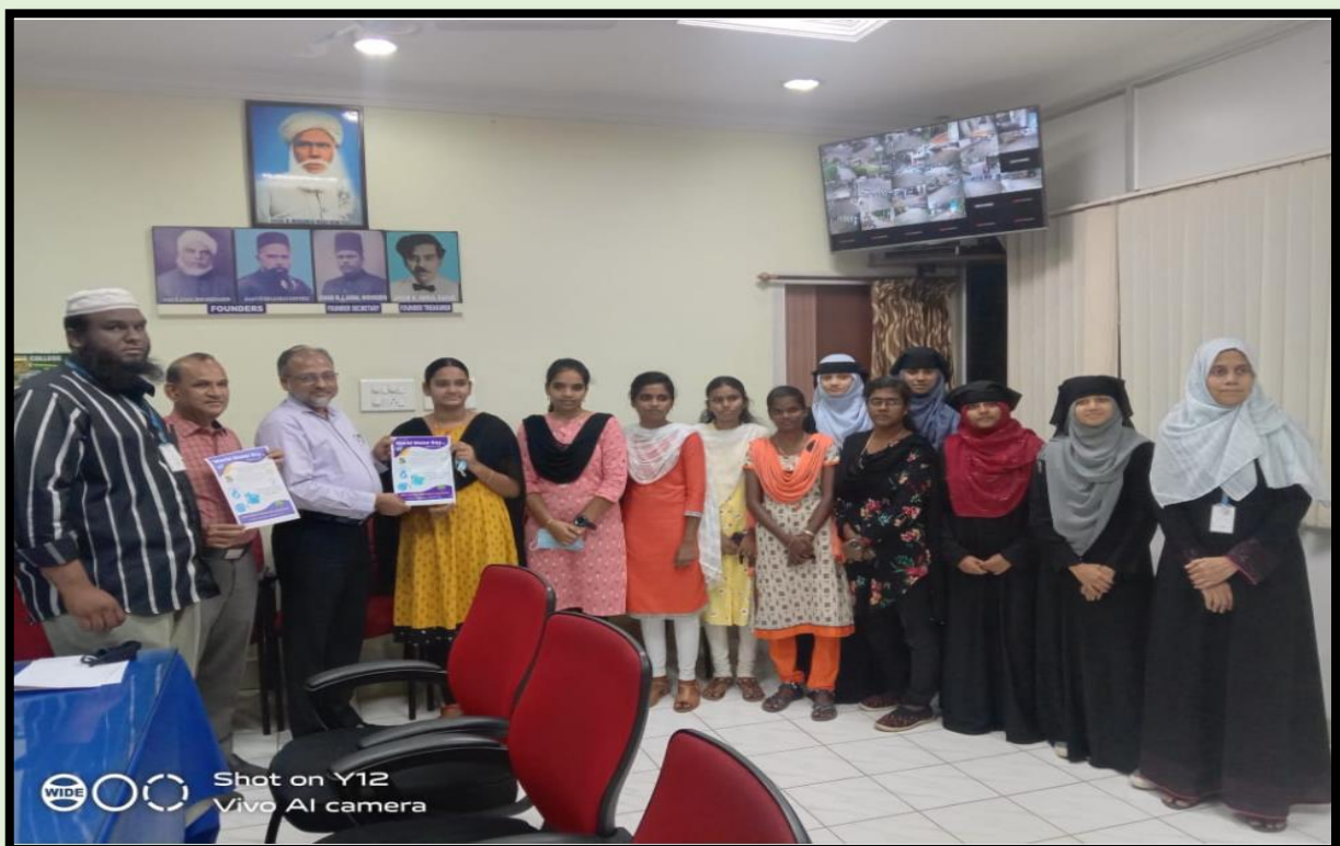
Students releasing first Copy of Flyer to our Principal