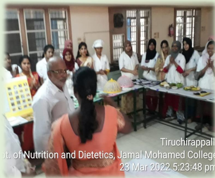
Tiruchirappalli Department of Nutrition and Dietetics, Jamal Mohamed College 23 Mar 2022 5:23:48 pm

Nutrition and Dietetics and B.Voc students exhibited the products after Food service Management and Diet Therapy Practical on 23.03.2022 and 03.03.2022