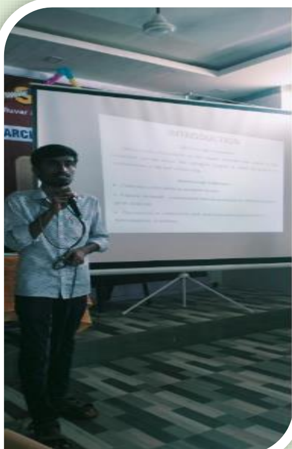
Chemistry Student Presenting a Paper in International Conference at Dr. RKS College, Kallakurichi