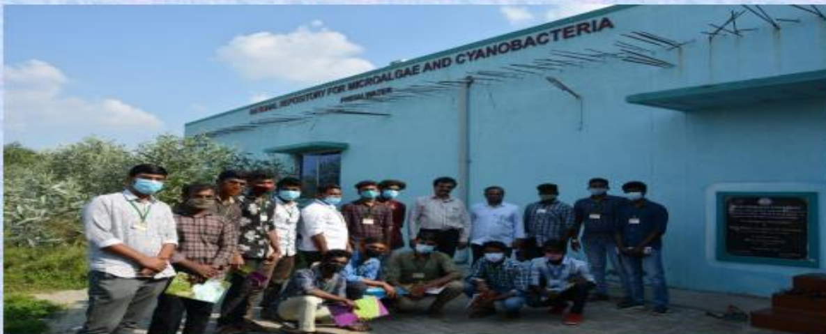
Students visited the National Repository for Microalgae and Cyanobacteria